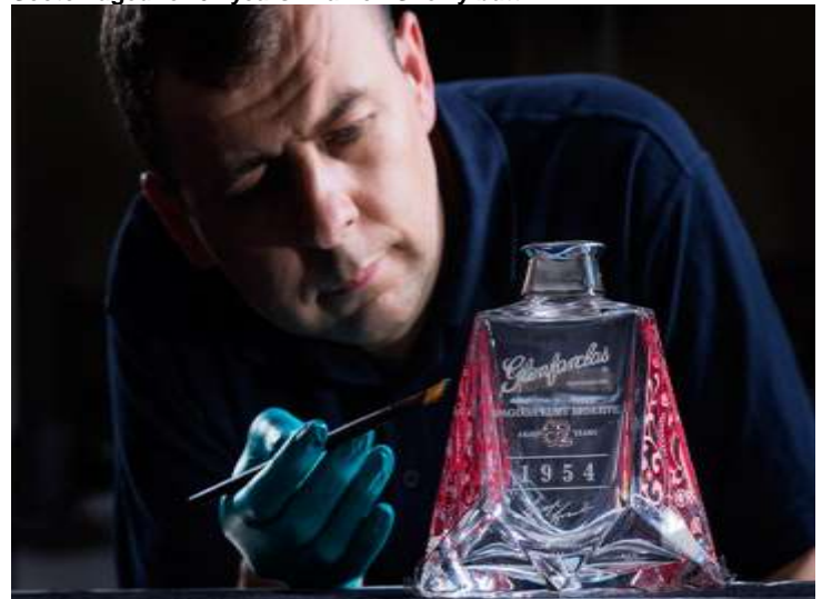
The Glenfarclas Pagoda Ruby Reserve is bottled in a decanter featuring 34 rubies Glenfarclas Pagoda Ruby Reserve is a limited edition bottling presented in a Glencairn decanter that features hand-mounted rubies. The whisky

Scotch aged for 62 years in an ex-Sherry butt.