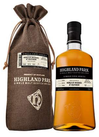
Only 642 bottles will be available exclusively from Heathrow Airport

Edrington has created a single cask expression of Highland Park Scotch whisky exclusively for World Duty Free at Heathrow Airport in London.