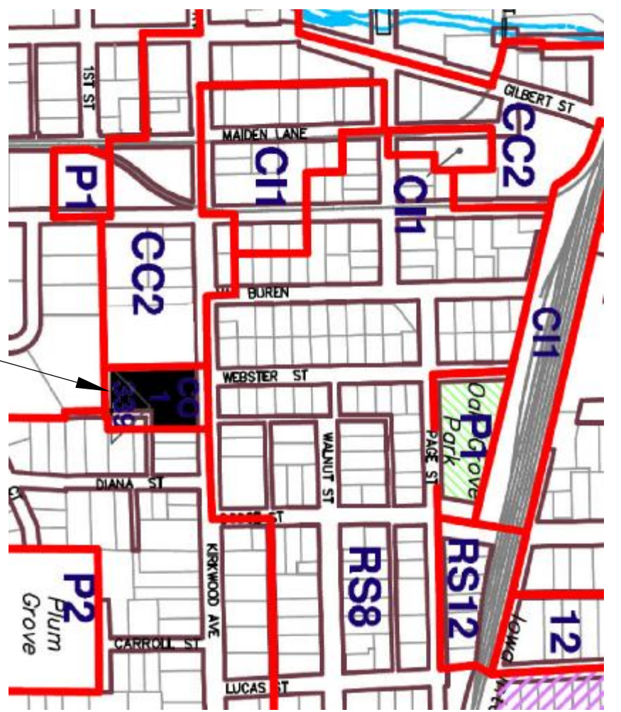
SITE LOCATION NO SCALE 605 KIRKWOOD AVE IOWA CITY, IA