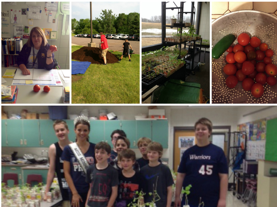
Outdoor Garden at Hidden Oaks Middle School

To encourage creativity , innovation and excellence by raising, managing and allocating financial resources to enhance learning for all who reside in, or are served by the ISD 719 community.