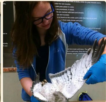
Raptor Data Integration