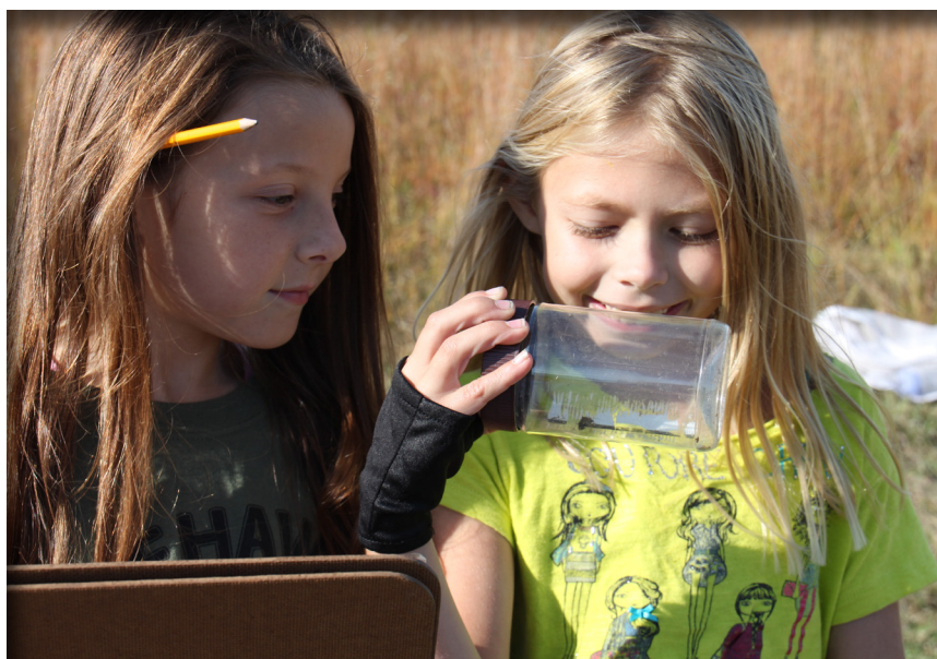
E-STEM in Action