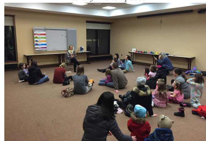
Spanish Book Reading at Library