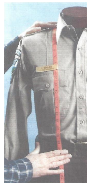
#5: Measure from the center top of the shoulder seam to the top of your belt.