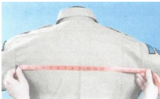
#2: With arms straight out the side, measure from shirt sleeve seam to shirt sleeve seam across the mid-shoulder base.