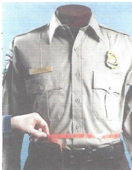
#4: Measure all the way around the widest part of your waist just above your duty belt.