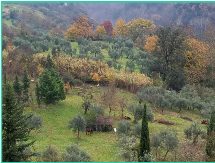
Siena – view from path