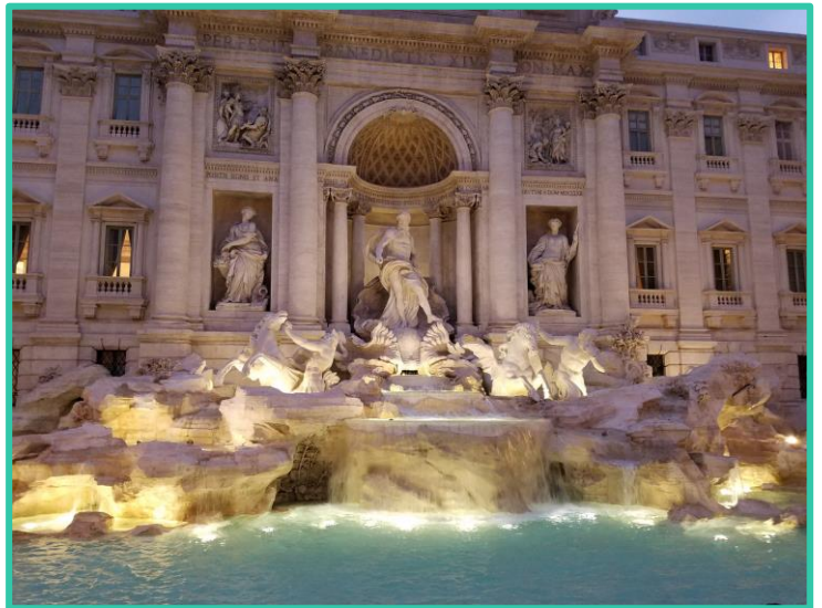
Trevi Fountain, Rome