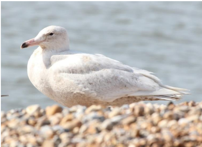
Glaucous Gull at Hythe (Ian Roberts)