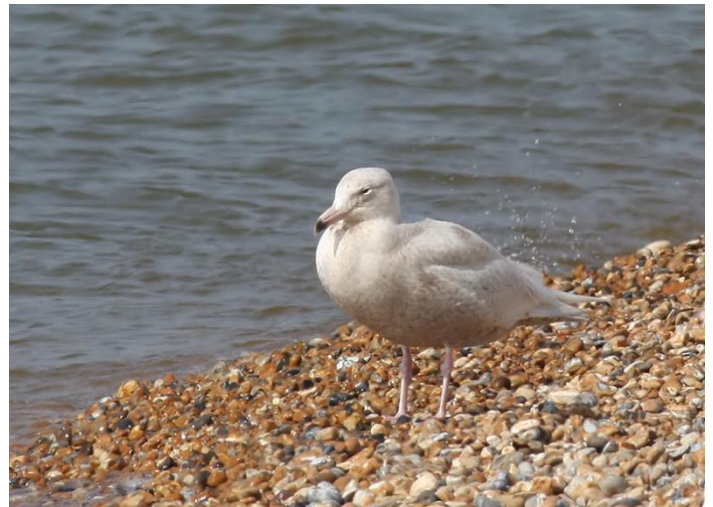
Glaucous Gull at Hythe (Brian Harper)