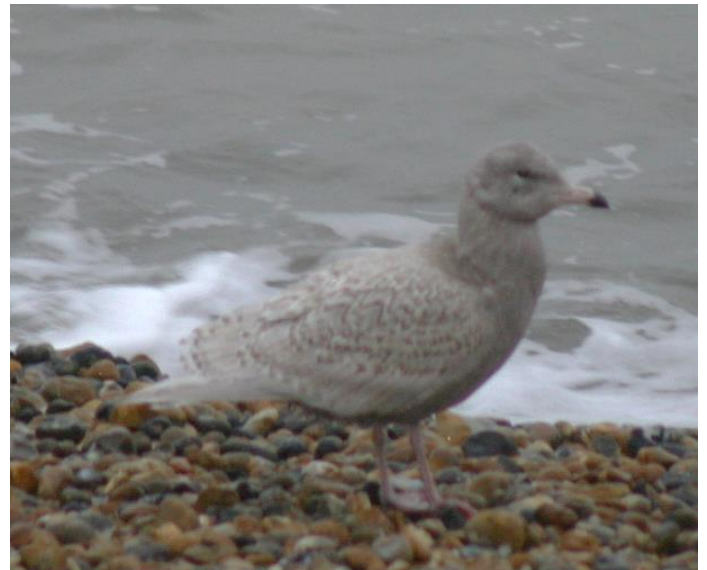
The two first-winter Glaucous Gulls at Hythe on 13 th November 2007 (Ian Roberts)