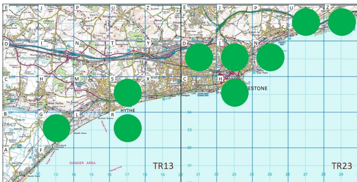
Figure 3: Distribution of all Glaucous Gull records at Folkestone and Hythe by tetrad

Figure 3 shows the location of records by tetrad.