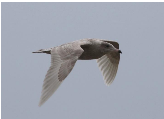
Glaucous Gull at Hythe (Ian Roberts)

It is an uncommon passage migrant and winter visitor to Kent, with occasional summer records.