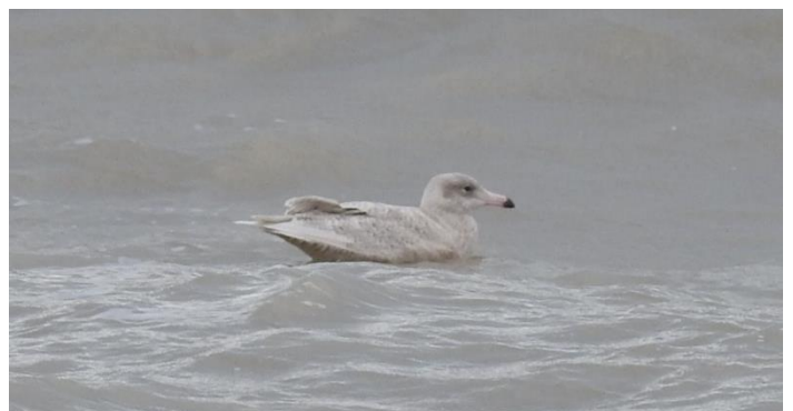
Glaucous Gull at Hythe (Sean McMinn)