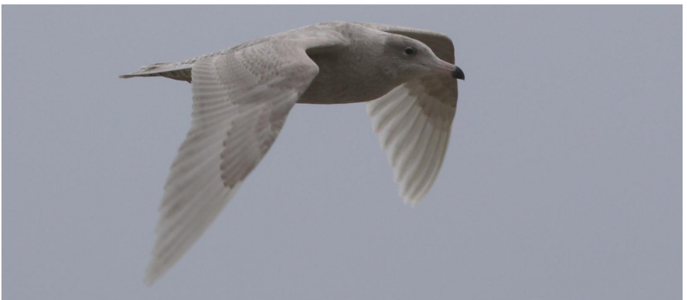
Glaucous Gull at Hythe (Ian Roberts)