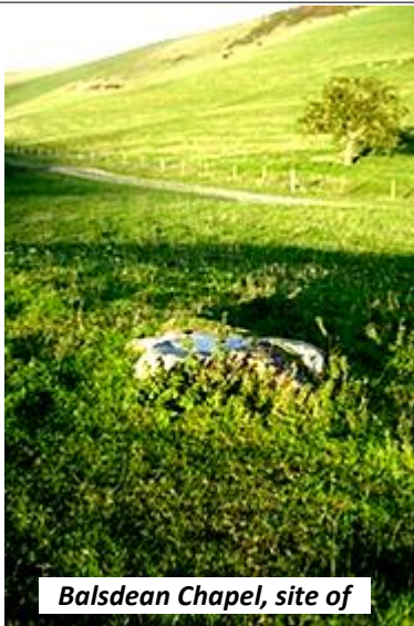
Balsdean Chapel, site of

At St Patrick's, please do continue to wear a face covering at Mass, if you can.