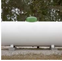
Fill your tanks before Winter!