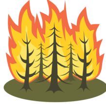
Firewise submissions due