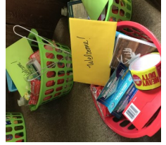
Stoneman POA "Bling" Basket/ letter