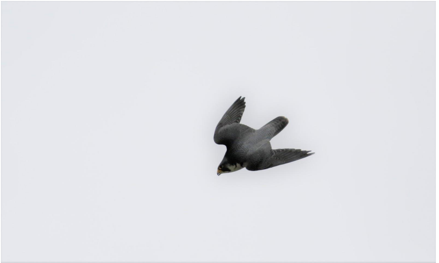
Peregrine at Samphire Hoe (Phil Smith)

The tetrad map images were produced from the Ordnance Survey Get-a-map service and are reproduced with kind permission of Ordnance Survey .