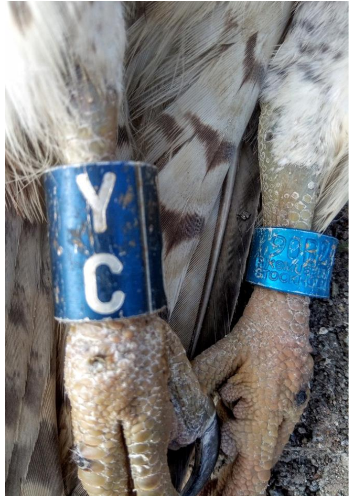
Peregrine at Folkestone (Steve Tomlinson)

Whilst Peregrines are most often seen hunting pigeons, the prey items that have been seen to have been taken locally have included Green Woodpecker and Water Rail.