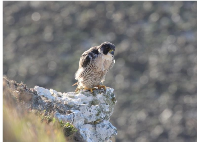
Peregrine at Abbotscliffe (Ian Roberts)

Populations from the northern and eastern parts of Europe are migratory, moving south to winter, but southern and western birds are mostly resident, with some dispersal of mainly juvenile birds (Snow & Perrins, 1998).