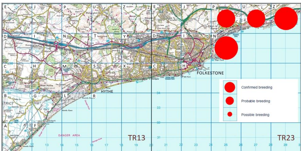
Figure 1: Breeding distribution of Peregrine at Folkestone and Hythe by tetrad (2007-13 BTO/KOS Atlas)

Figure 1 shows the breeding distribution by tetrad based on the results of the 2007-13 BTO/KOS atlas fieldwork.