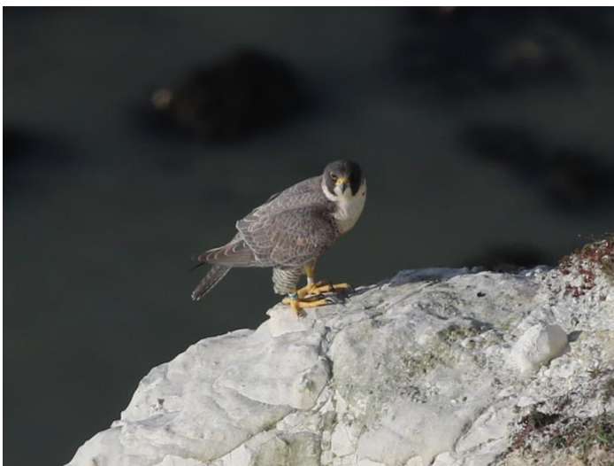
Peregrine 'Green 21' at Abbotscliffe