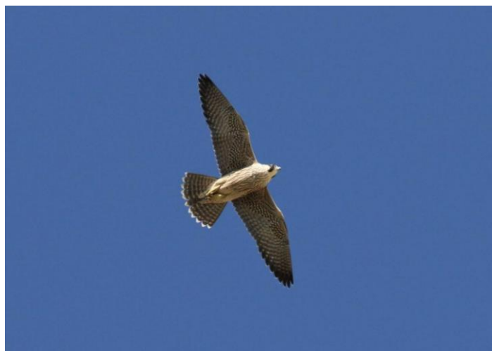
Peregrine at Samphire Hoe