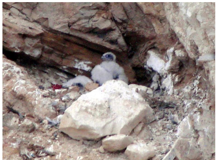
'Green 21' as nestling at Birling Gap (Jon Franklin)