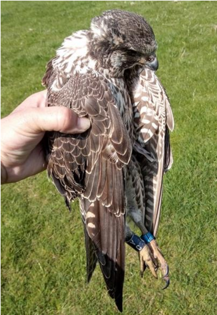
Peregrine at Folkestone (Steve Tomlinson)

The second involved a first-year male found dead at Beachborough on the 1 st April 2019 that had been ringed as a nestling in northern Sweden in the preceding June (Steve Tomlinson, pers. comm.) Recoveries of foreign-ringed Peregrines in Britain are a scarce occurrence, with Wernham et al (2002) recording 14 instances, all originating from Scandinavia.