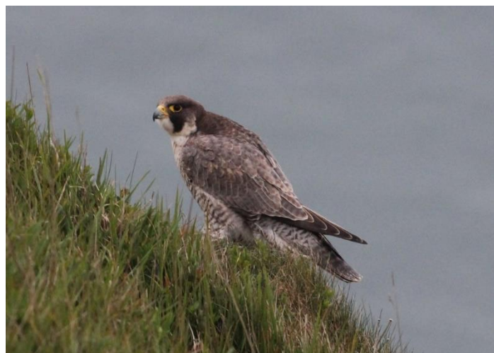
Peregrine at Abbotscliffe

Clements et al noted that since the coastal cliff sites have become fully re-occupied, subsequent increases in the county have resulted from occupation of man-made sites, such as inland quarries, pylons and tall buildings, whilst in neighbouring counties nest-sites in trees have been utilised. They reported an estimated population of around 30-40 pairs in Kent during the most recent atlas and considered that more marginal sites were likely to become occupied in future.