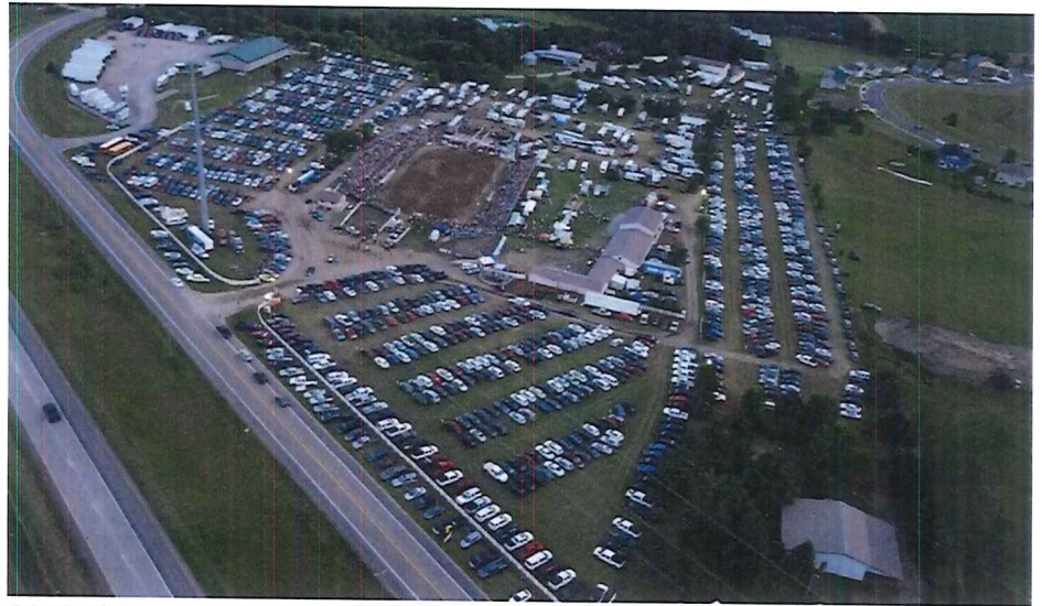
2019 Clearwater Rodeo

The Silver Bullet Saddle Club is excited to bring you Minnesota's BEST amateur rodeo again on August 19 th , 20 th & 21 st , 2022!