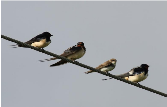
Sand Martin and Swallows at Nickolls Quarry

The surrounding bushes, particularly those bordering Botolph's Bridge Road, are worth checking for migrant warblers, crests and flycatchers, and Yellow-browed Warbler has occurred. Wheatear, Whinchat and Redstart can also appear on migration and Stonechats overwinter.