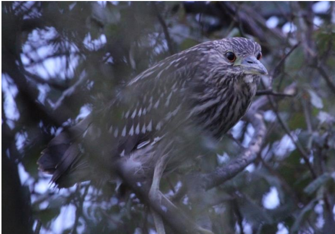
Night Heron at Nickolls Quarry

In the 1990s a reed-bed in the works area was used as a roosting site for Pied and Yellow Wagtails, with peak counts of 281 of the former and 100 of the latter.