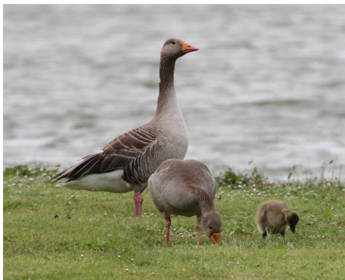
Greylag Geese at Nickolls Quarry