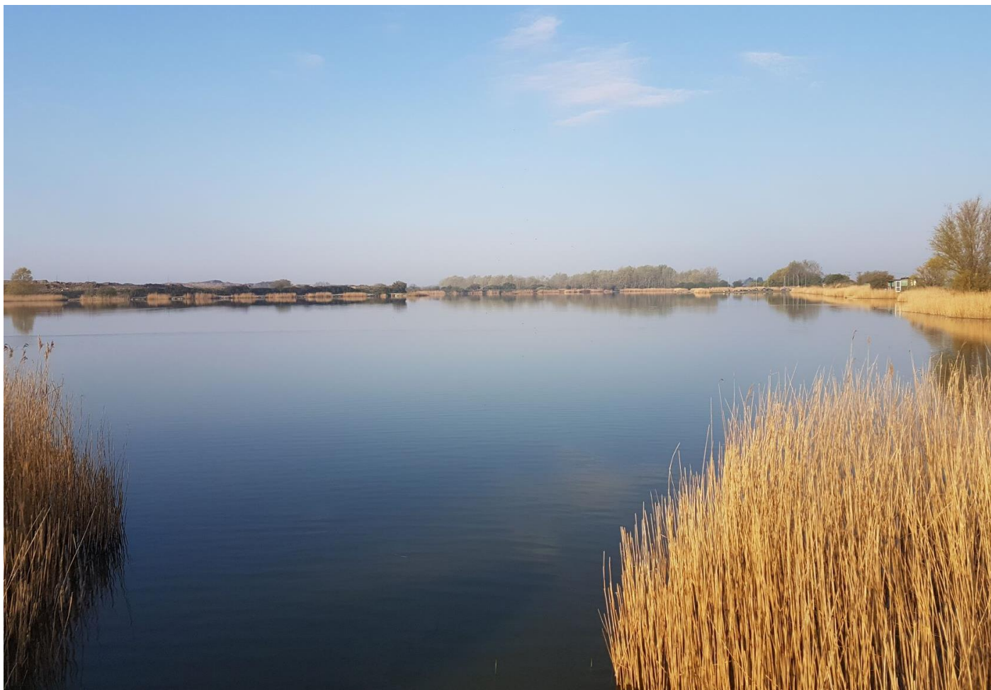
The main lake in 2020. Looking west from the eastern footpath

Despite its reduction, the lake continued to be largest area of open water in the local area and so remains one of the best areas for wildfowl, particularly during cold weather, for example in December 2010 when there were peak counts of 170 Wigeon, 107 Coot, 104 Pochard, 100 Teal, 53 Tufted Duck, 34 Gadwall, 18 Mute Swan, 12 Pintail, 10 Bewick's Swan, 8 Shoveler, singles of Goldeneye and Goosander, and 300 White-fronted Geese flew over.