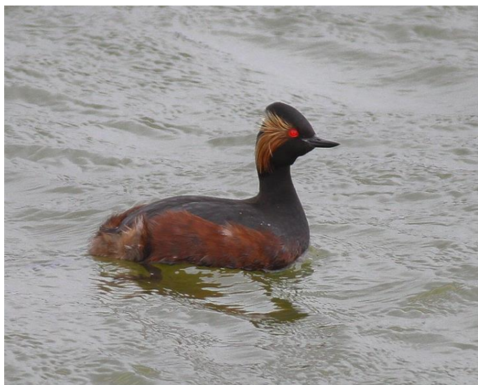
Black-necked Grebe at Nickolls Quarry