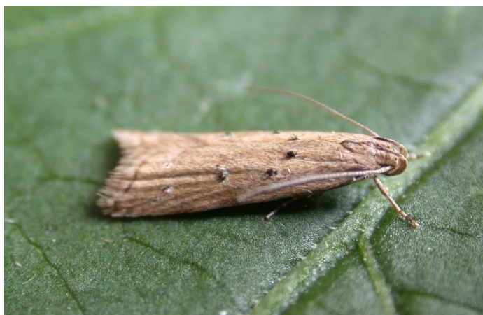
Brachmia inornatella at Nickolls Quarry

As the tetrad has attracted birdwatchers and other naturalists for many years several groups are fairly well-recorded from some areas. Some environmental surveying has also been undertaken as part of the building application for the Nickolls Quarry site. Recent moth trapping undertaken between 2017 and 2021 at Nickolls Quarry has increased the tetrad list to over 480 species, including a number of specialist wetland species such as Orthotelia sparganella (Reed Fanner), Agonopterix conterminella (Sallow Flat-body), Cosmopterix scribaiella (New Marsh Cosmet), Cosmopterix lienigiella (Fen Cosmet), Brachmia inornatella (Fen Crest), Apotomis lineana (Willow Marble), Anania perlucidalis (Fenland Pearl), Water Ermine, Reed Dagger, Silky Wainscot, Twin-spotted Wainscot and Double Lobed.