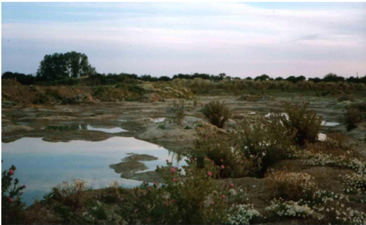
The “shingle shallows” at Nickolls Quarry. An attractive area for waders in 2001 to 2004 before it was backfilled