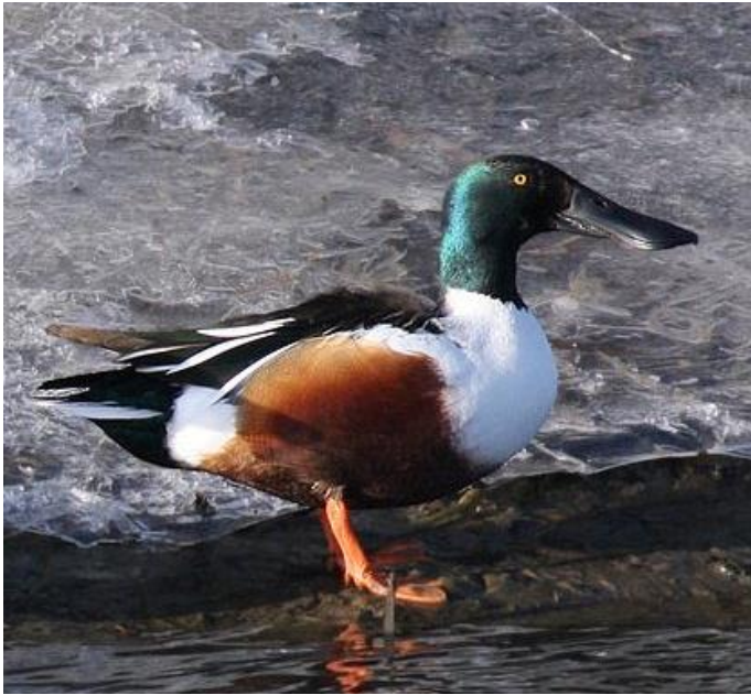
Shoveler at Botolph's Bridge