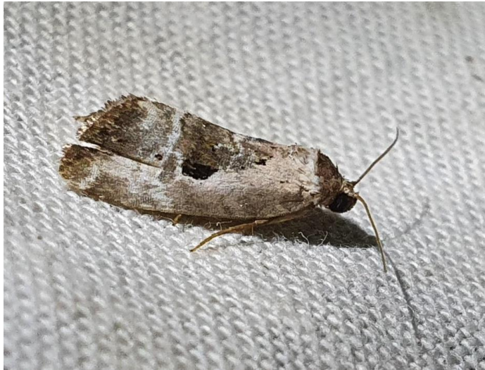
Rosy Marbled at Nickolls Quarry

A colony of at least 70 Sitaris muralis (Flame-shouldered Blister Beetle) discovered at Palmarsh on the 14 th August 2018 constituted the first county record and probably only the fourth modern British occurrence (and were noted again in 2019).