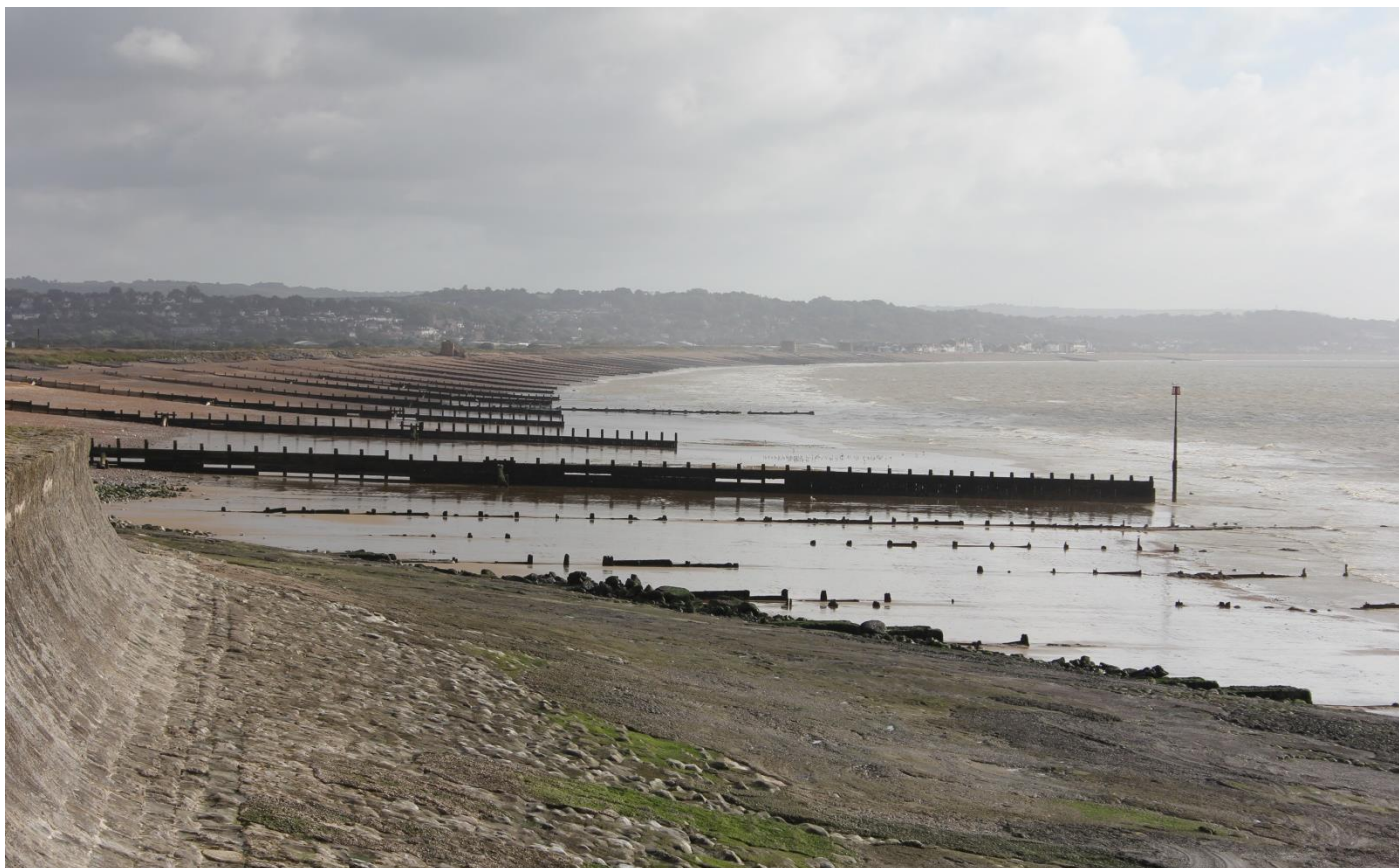
Hythe Ranges, looking east from the Dymchurch Redoubt