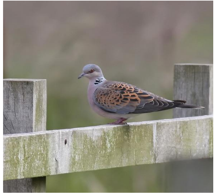
Turtle Dove at Botolph's Bridge