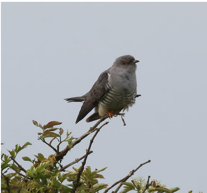
Cuckoo at Nickolls Quarry