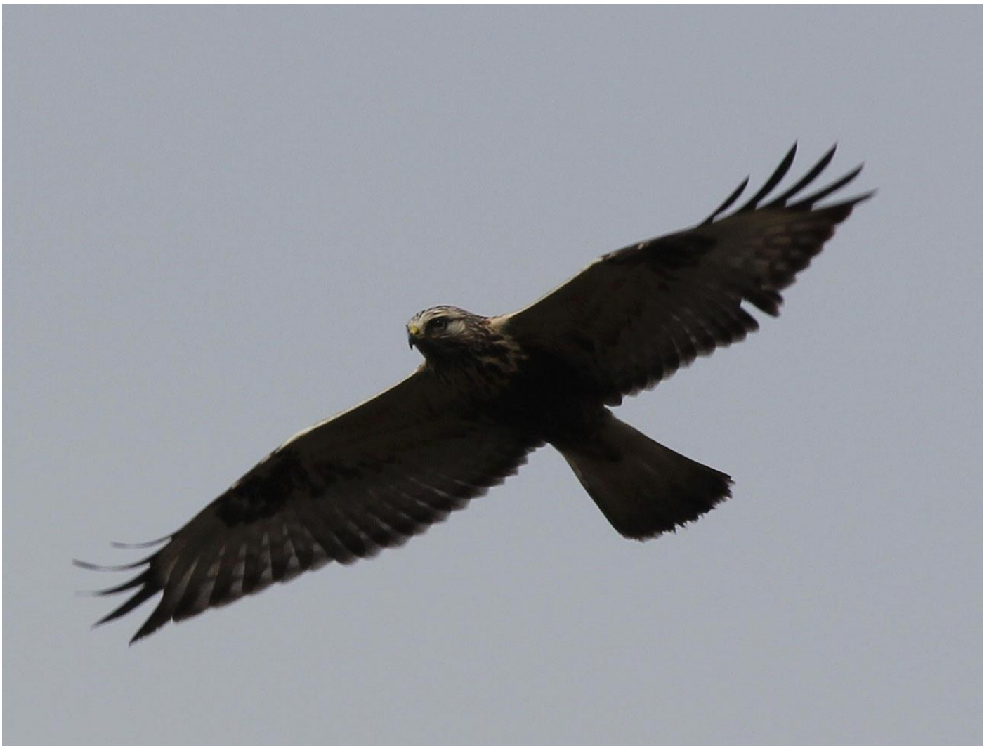
Rough-legged Buzzard at Nickolls Quarry

More unusual occurrences have included Quail, Little Auk, Bee-eater, Lesser Spotted Woodpecker, Hooded Crow, Wood Lark, Marsh Warbler, Waxwing, Bluethroat, Twite and Hawfinch. A list of all 215 category A and C species recorded at the site is provided at the end of this guide.