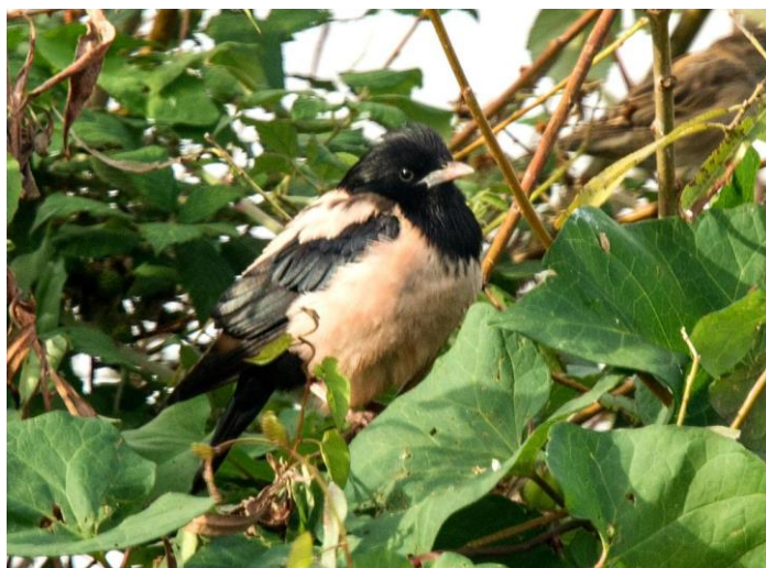
Rose-coloured Starling at Palmarsh