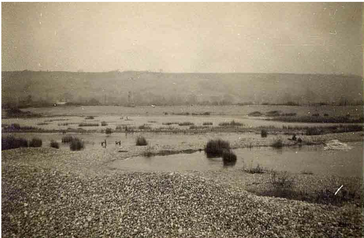
Nickolls Quarry in 1952. Looking approximately northwards across the “old pit” towards the Hythe Roughs