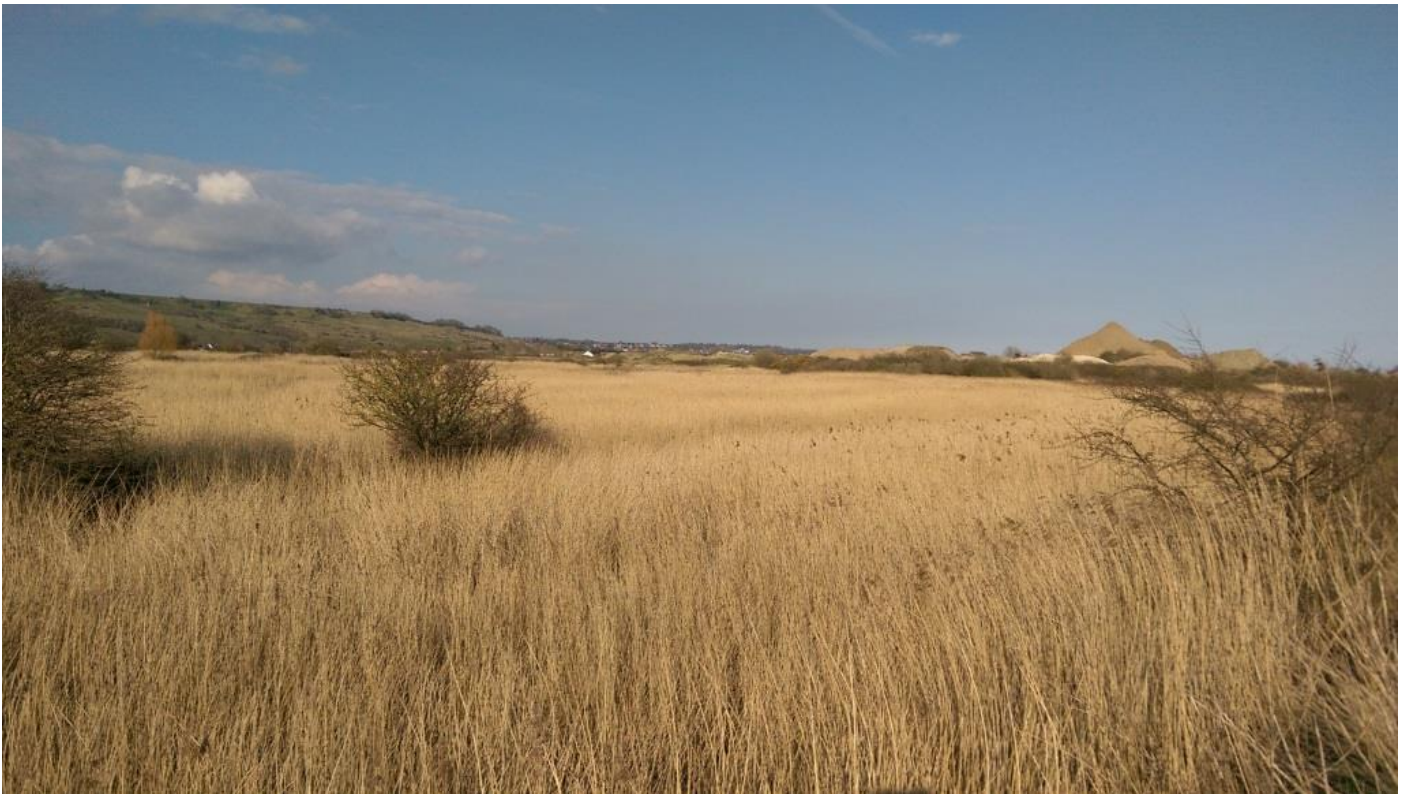
Reed-bed at Nickolls Quarry in 2016

Little Egrets are now seen regularly and Great White Egret, Night Heron, Squacco Heron and Purple Heron have recently been added to the list, with Bitterns recorded in two years and five records of Spoonbill. Marsh Harriers were occurring with increased frequency, with roosting noted for the first time in early 2018, whilst breeding possibly occurred in 2020, but the reedbed area has since been cleared. Hobby remain regular on passage and in summer, as do Peregrine and occasionally Merlin in winter. Scarcer visitors have included Honey Buzzard, Red Kite, Hen Harrier, whilst Montagu's Harrier, Osprey and even Red-footed Falcon, whilst a Rough-legged Buzzard regularly hunted over the site in November to December 2011. Barn Owl, Short-eared Owl and Long-eared Owl have also been recorded.