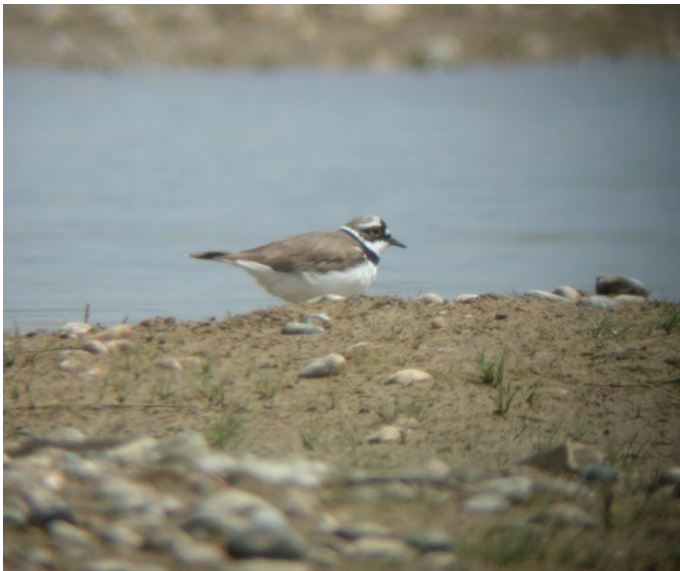
Little Ringed Plover at Nickolls Quarry