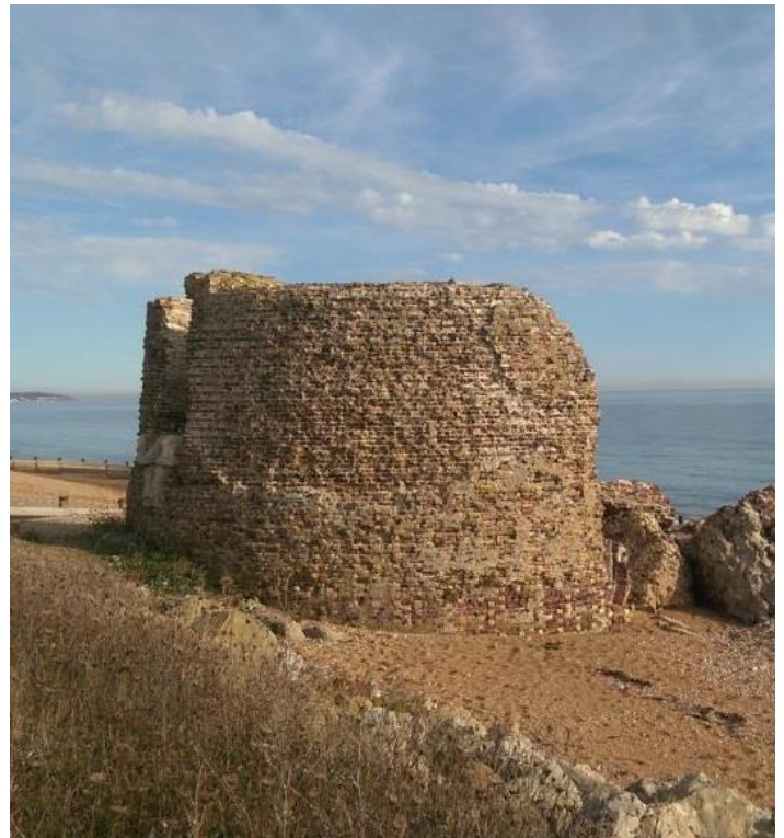
Martello Tower number 19