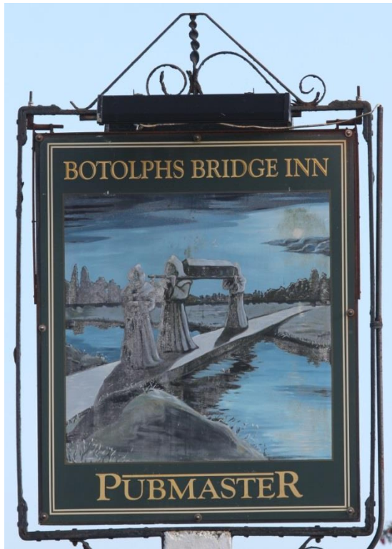
Botolph's Bridge Inn sign

By the time the Redoubt was finished the threat of invasion by Napoleon was over. During World War I, it was used for troop accommodation and in World War II, when the south coast was again at risk of invasion, two 6-inch breech-loading guns were mounted in casemates built over the original gun emplacements. A prominent battery observation post was built, and pill boxes were sited on the parapet in order to repel an infantry attack. It was fully operational by 1942 as an Emergency Coastal Battery. After the war, the observation post was used as a Coastguard lookout and radar was installed to monitor shipping in the English Channel.