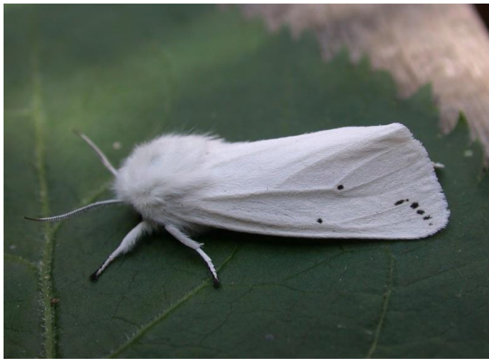
Water Ermine at Nickolls Quarry