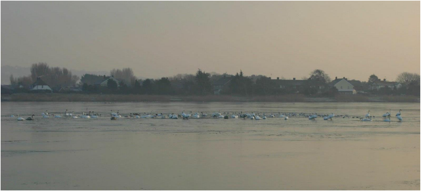
An accumulation of wildfowl at Nickolls Quarry during hard weather, looking east from near the sailing club

The lake often holds a pre-roost of gulls, particularly during cold weather, and Iceland, Glaucous, Caspian and Yellow-legged have been noted. A pair of Common Terns formerly bred on the island until 1997, with Arctic, Black and Little having been recorded on passage. Three species of diver have occurred.