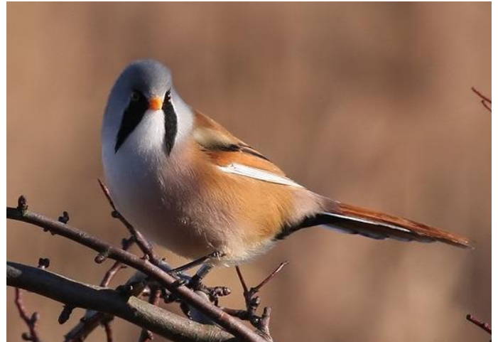
Bearded Tit at Nickolls Quarry