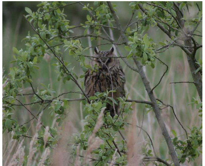
Long-eared Owl at Nickolls Quarry