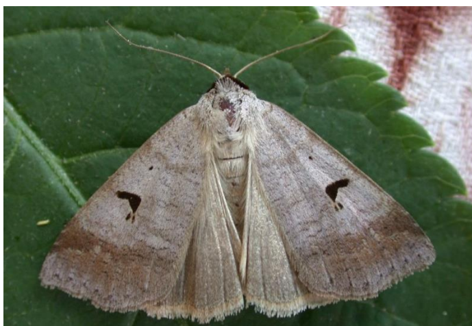
The Blackneck at Nickolls Quarry