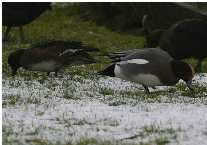
Wigeon at Nickolls Quarry

The lake is surrounded by reeds and scrub which support breeding Cetti's, Reed and Sedge Warblers, and Reed Bunting, with Water Rail on passage and in winter, and Bearded Tit was occurring with increasing regularity until the reed-bed began to be cleared.