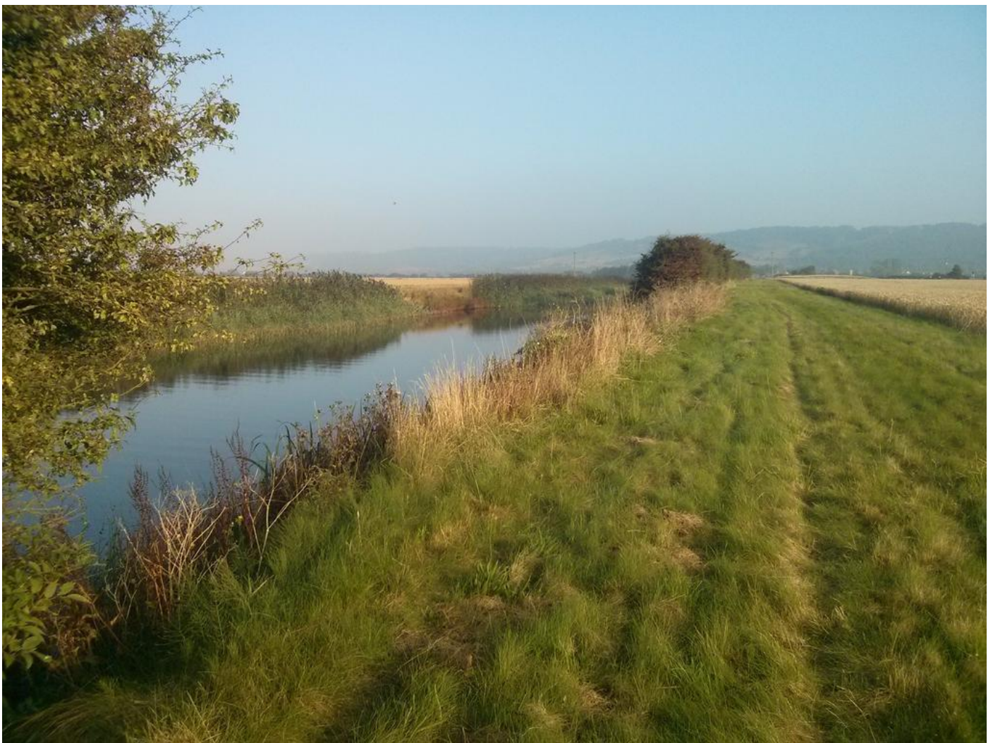
Canal cutting, looking north towards the rail and road bridges

The field at the southern end, between Botolph's Bridge Road and the canal cutting, is prone to flooding when it attracts Snipe and occasionally Jack Snipe or Woodcock in winter and passage waders such as Whimbrel in spring, whilst in June 2012 a Marsh Warbler held territory here.