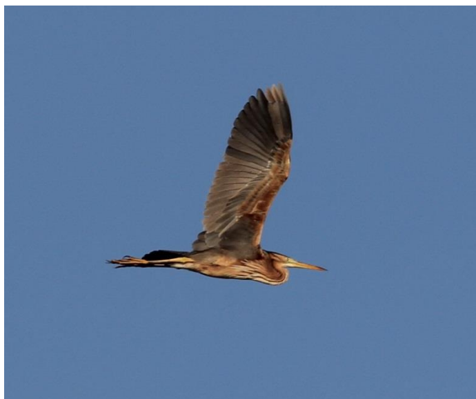
Purple Heron at Nickolls Quarry