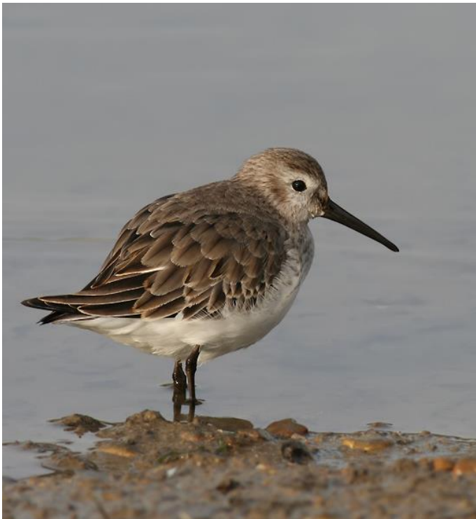
Dunlin at Botolph's Bridge