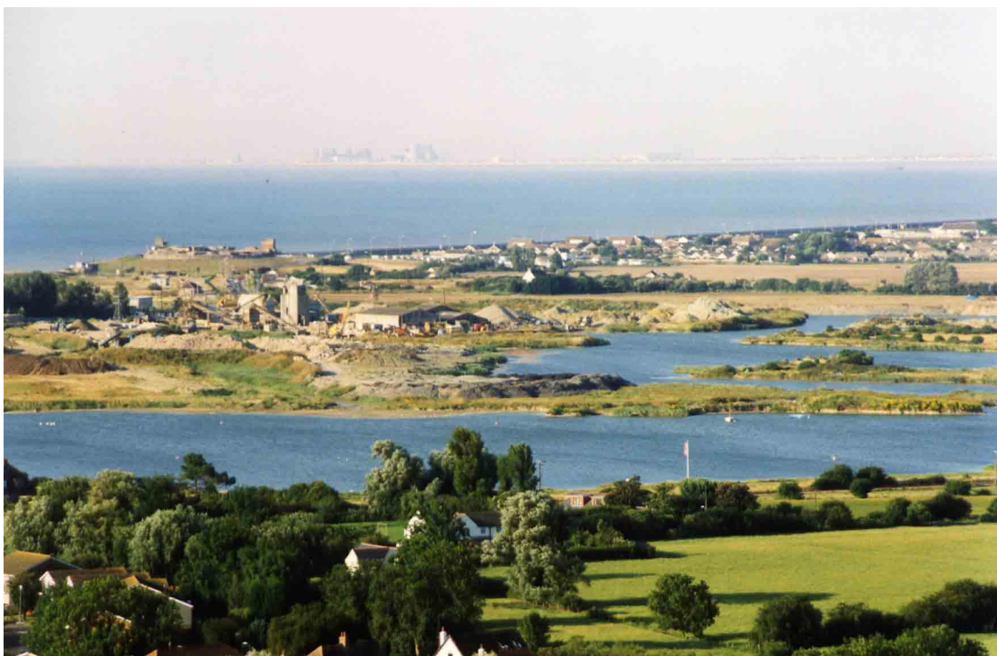
Nickolls Quarry in 1998. Looking south-west across the site towards Dungeness