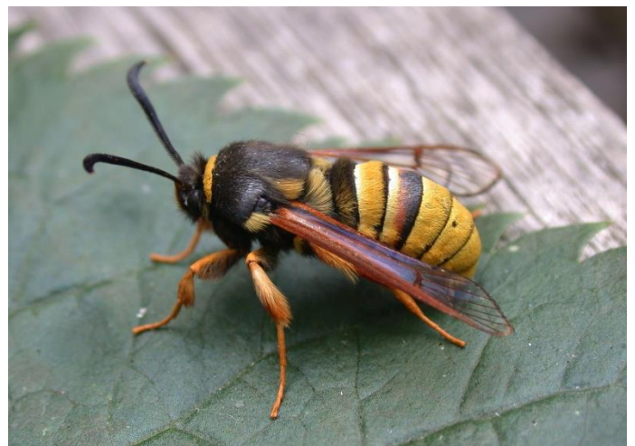
Lunar Hornet Moth at Nickolls Quarry