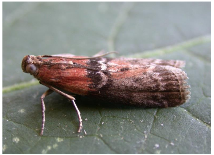
Sciota adelphella at Nickolls Quarry

Of particular significance is the Sussex Emerald, a highly localised species otherwise known mainly from Dungeness, with a small population at Kingsdown and another very recently discovered at Rye Harbour (East Sussex), which at the ranges feeds on Wild Carrot along the seawall. It has also strayed to Nickolls Quarry, whilst other presumed wanderers from the ranges have included Aethes dilucidana (Short-barred Yellow Conch), Ethmia terminella (Five-spot Ermel) and Ethmia bipunctella (Bordered Ermel) and Cynaeda dentalis (Starry Pearl).