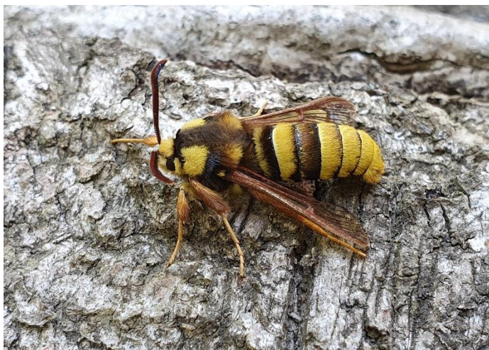
Hornet Moth at Cinderella Farm

Of particular significance is the Sussex Emerald, a highly localised species otherwise known mainly from Dungeness, with a small population at Kingsdown and another very recently discovered at Rye Harbour (East Sussex), which at the ranges feeds on Wild Carrot along the seawall. It has also strayed to Nickolls Quarry, whilst other presumed wanderers from the ranges have included Aethes dilucidana (Short-barred Yellow Conch), Ethmia terminella (Five-spot Ermel) and Ethmia bipunctella (Bordered Ermel) and Cynaeda dentalis (Starry Pearl).