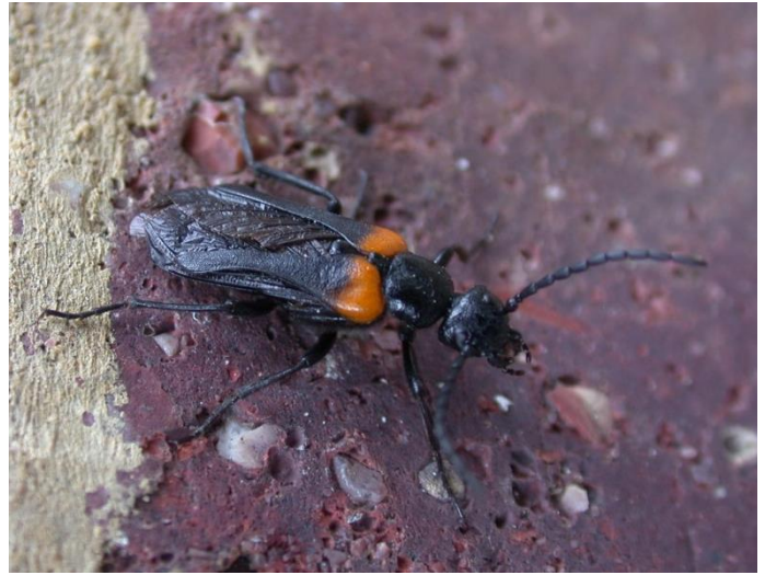
Sitaris muralis at Palmarsh

The presence of Great Crested Newt and Marsh Frog in the tetrad are notable. The latter is largest of British frogs and is said to have been introduced in 1935 from Hungary possibly into local garden ponds at Lympne (and at Stone-in-Oxney). It spread very rapidly along the Marsh dykes and by 1940 had reached the western extremity of Romney Marsh at Pett Level, also colonising the Royal Military Canal and surrounding marshland.