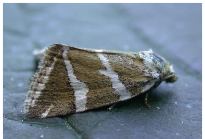
Silver Barred at Nickolls Quarry

The migrant butterflies Clouded Yellow and Painted Lady have been noted in the tetrad, whilst the Wall butterfly appears to be a recent colonist.