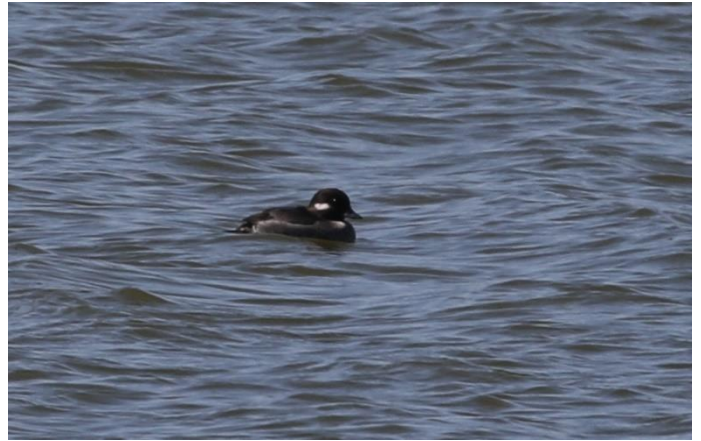
Bufflehead at Nickolls Quarry