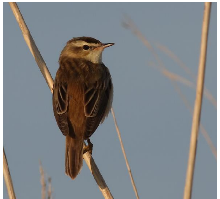
Sedge Warbler at Nickolls Quarry