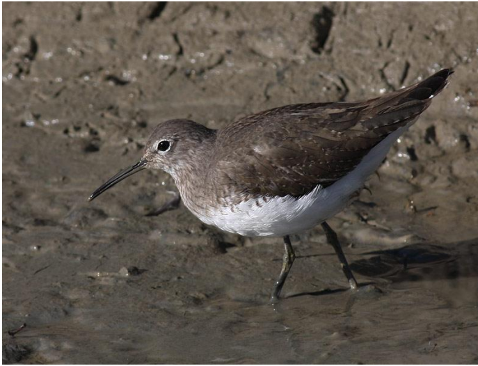
Green Sandpiper at Botolph's Bridge