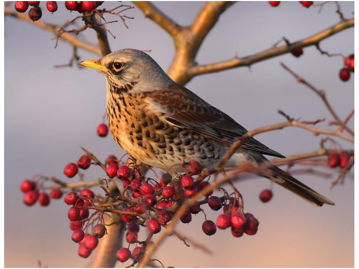
Fieldfare at Botolph's Bridge