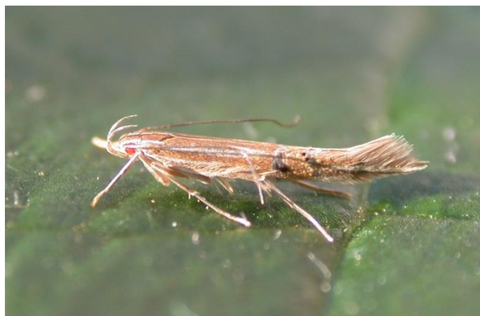
Cosmopterix lienigiella at Nickolls Quarry

A number of rare migrants or notable scarce residents have included Euspilapteryx auroguttella (Gold-dot Slender), Sciota adelphella (Willow Knot-horn), Acrobasis tumidana (Scarce Oak Knot-horn), Ancylosis oblitella (Saltmarsh Knot-horn), Sub-angled Wave, Portland Ribbon Wave, Oak Processionary, the Blackneck, Golden Twin-spot, Silver Barred, the Four-spotted and Rosy Marbled. Other more regular migrants have included Palpita vitrealis (Olive-tree Pearl) and the Vestal. Recent use of pheromone lures has confirmed the presence of both Hornet Moth and Lunar Hornet Moth within the tetrad.