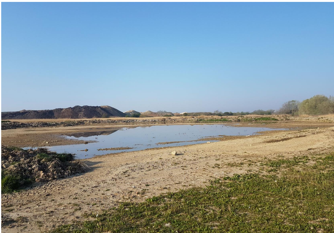
Temporary pool created during construction works in 2020