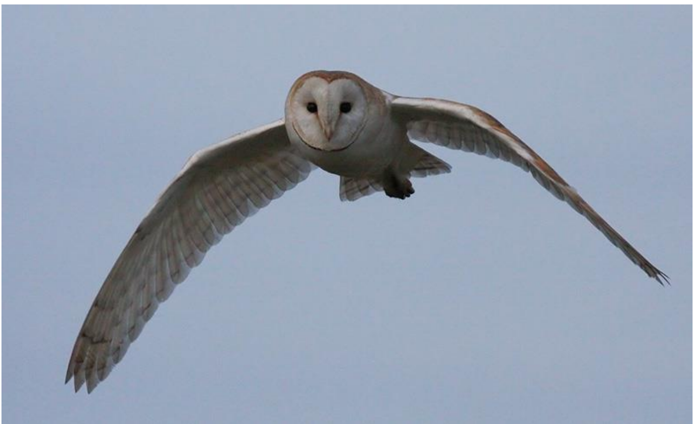
Barn Owl at Botolph's Bridge

Wheatear, Whinchat, Black Redstart and the commoner warblers regularly occur on passage and Grasshopper Warbler, Ring Ouzel, Pied Flycatcher and Tree Pipit have been noted, whilst rarer species have included Stone Curlew, Hooded Crow, Woodlark, Shore Lark and Snow Bunting, with Tundra Bean Goose, Spoonbill and Montagu's Harrier flying over.