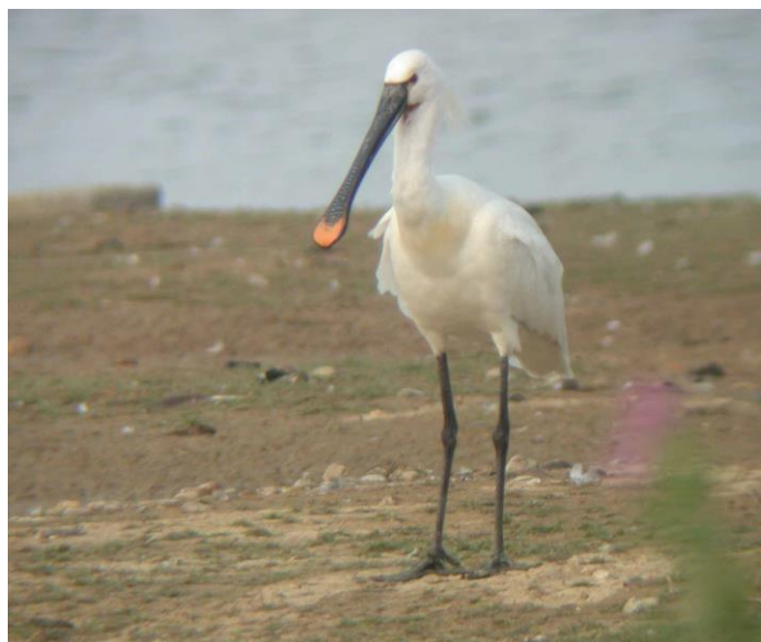
Spoonbill at Nickolls Quarry