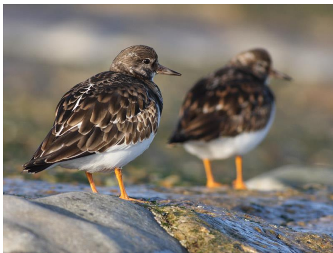
Turnstones at the Dymchurch Redoubt