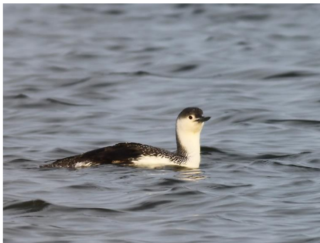
Red-throated Diver at Nickolls Quarry