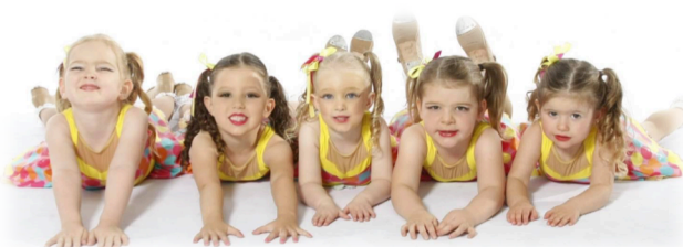
Washing your hands