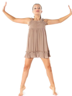
Maintaining a social distance of 1.5m