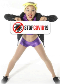
Following Covid Safe signs & guidelines