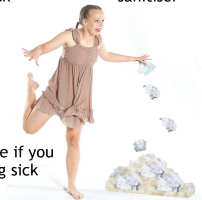
Staying home if you are feeling sick