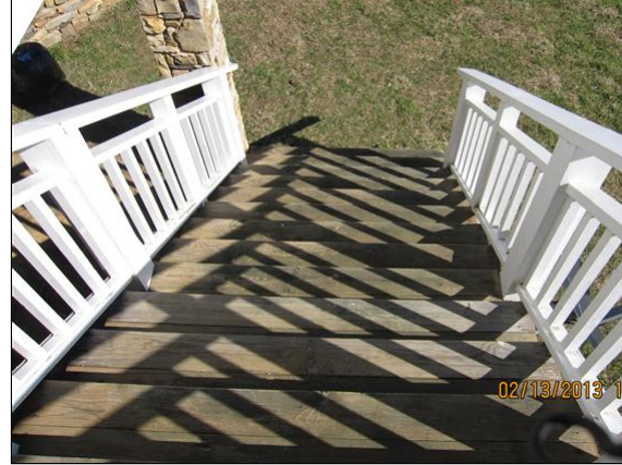
2.3 Item 1(Picture)