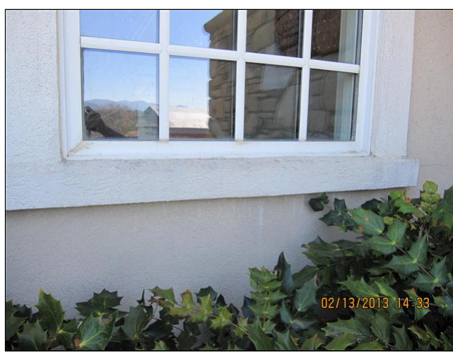
2.4 Item 1(Picture)