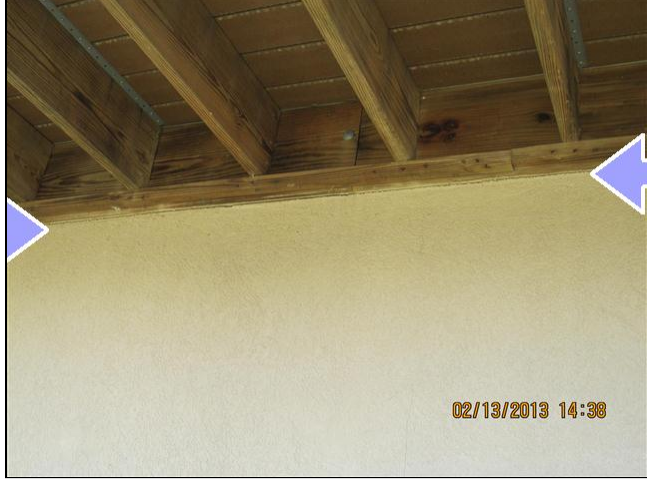
2.0 Item 4(Picture)

2.0 (3) A common seam where stucco and ledger meet under deck. I recommend silicone caulking to seal.