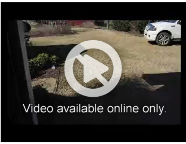
3.5 Item 1(Video)

3.5 The garage door at the right side (facing front) will not reverse when met with resistance. This is considered unsafe and needs correcting. A qualified contractor should inspect and repair as needed.