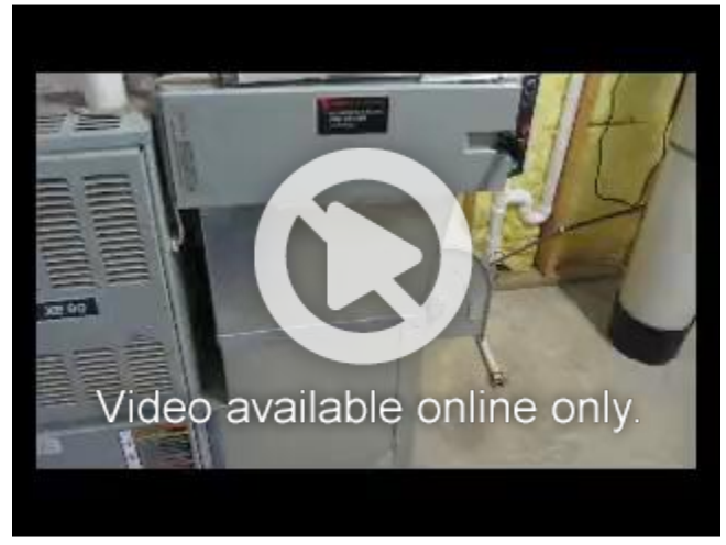
8.3 Item 1(Video)

8.3 The electronic filter at air handler in equipment room apparently is non operational and a disposable cartridge filter is now the media for filtering the air handler unit. This filter is considered acceptable as a means of air filtration. Repairing the electronic air cleaner is expensive and currently this unit does not appear to have a functioning electronic air cleaner.