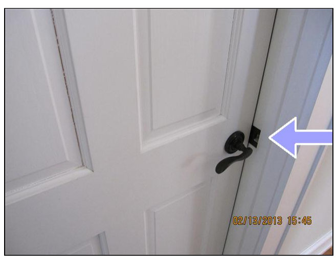
4.5 Item 1(Picture)

4.5 Master bedroom closet door (His) will not latch easily, needs adjustment