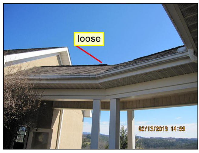
1.2 Item 1(Picture)

1.2 Ridge vent loose at end above breezeway and needs to be fastened. Nail head used to fasten should be sealed with sealant.