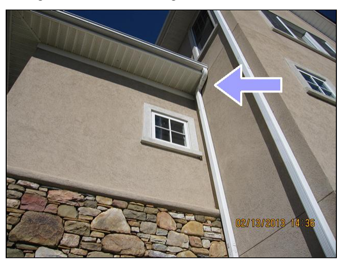
2.0 Item 3(Picture)

2.0 (2) Bird nest is wedged between downspout elbow and home should be removed and inspect further as animals can damage and allow water to get inside wall.