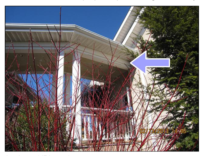
2.5 Item 1(Picture)

2.5 Some areas need prep and paint along breezeway at top fascia trim (cosmetic).