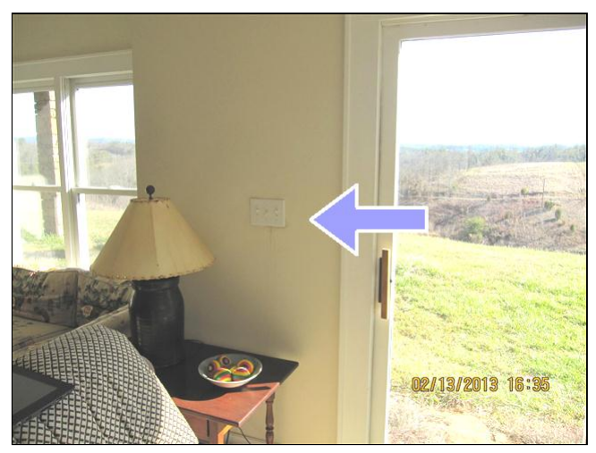
4.1 Item 2(Picture) wall switch Lower level