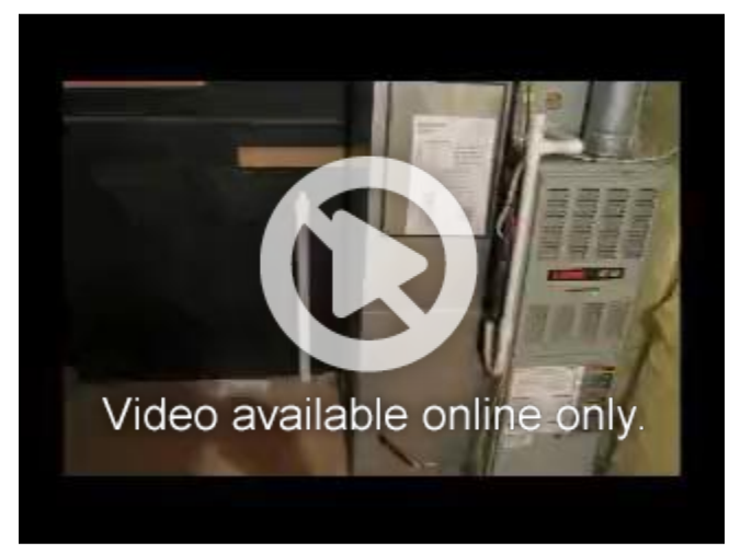
8.5 Item 1(Video)

8.5 Leak stain is present in the attic at the chimney liner currently with a woodstove. This may be an old stain or it may not? I recommend a qualified contractor investigate further and repair. Area accessible in attic see video. Do not walk or step onto the metal.