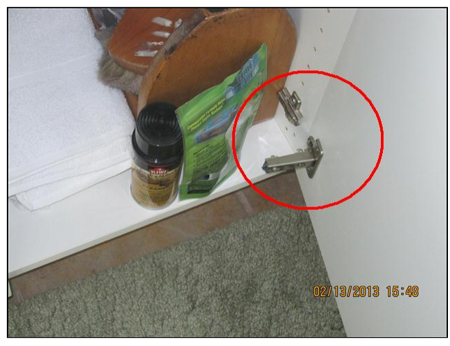
4.4 Item 1(Picture)