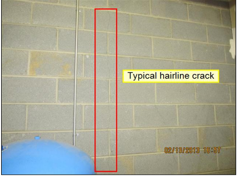
5.1 Item 1(Picture)

5.5 FYI: Door to attic should be locked to prevent children from entering and risk fall as some areas are not meant to be walked upon.