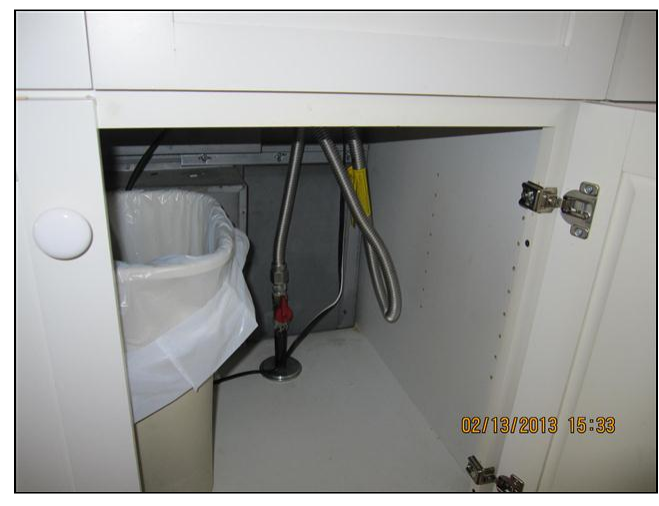
6.4 Item 3(Picture)

6.4 (2) Gas odor detected under range in kitchen and also upon entering into Equipment room downstairs where LP gas water heater is located. Note, there is a fresh air pipe connecting the equipment room to the outside air. Some energy pros may suggest that a mechanical fan would be more energy efficient than the passive vent installed.