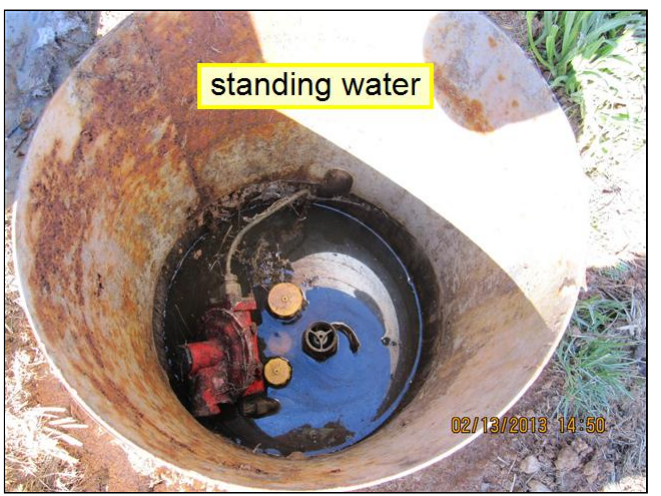
6.4 Item 2(Picture) propane tank valves