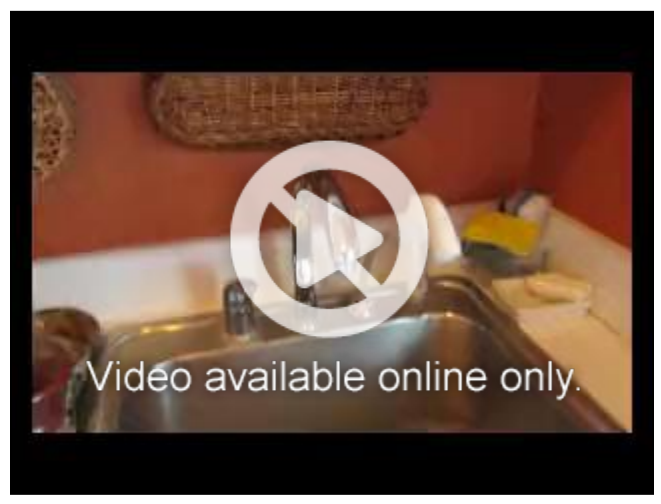
6.1 Item 3(Video)

6.1 (2) Spray nozzle inoperable at laundry room sink.