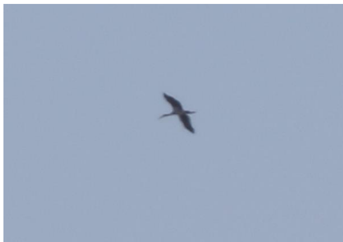
Black Stork at Crete Road East (Ian Roberts)