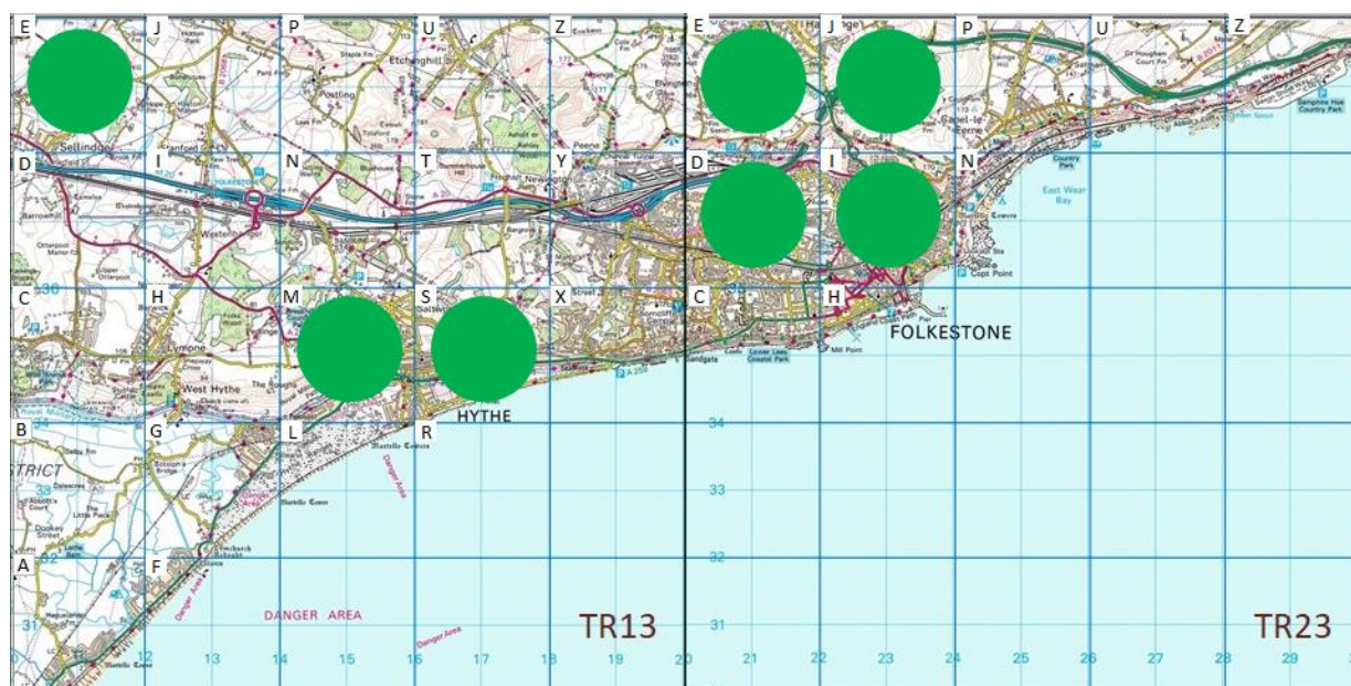
Figure 3: Distribution of all Black Stork records at Folkestone and Hythe by tetrad

Figure 3 shows the distribution of records by tetrad.