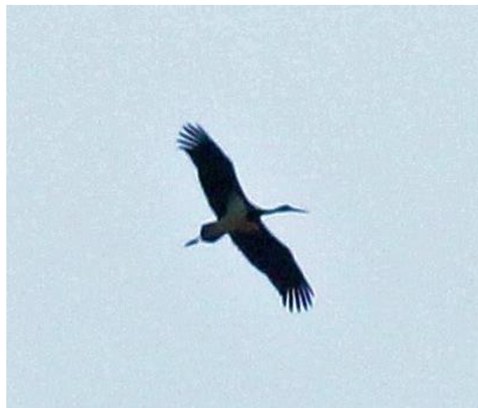
Black Stork at Sellindge

There had been 28 records in Kent to the end of 2019, with sightings in all months from April to October, although with a peak in May and June (both with five records) (KOS, 2021).