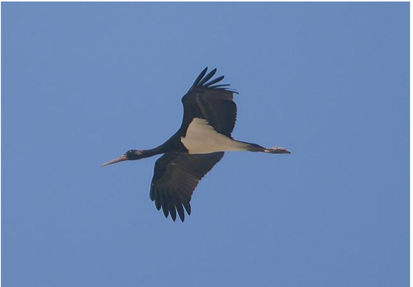
Black Stork at Dungeness (Martin Casemore), the same bird earlier seen at Hythe

The tetrad map images were produced from the Ordnance Survey Get-a-map service and are reproduced with kind permission of Ordnance Survey .