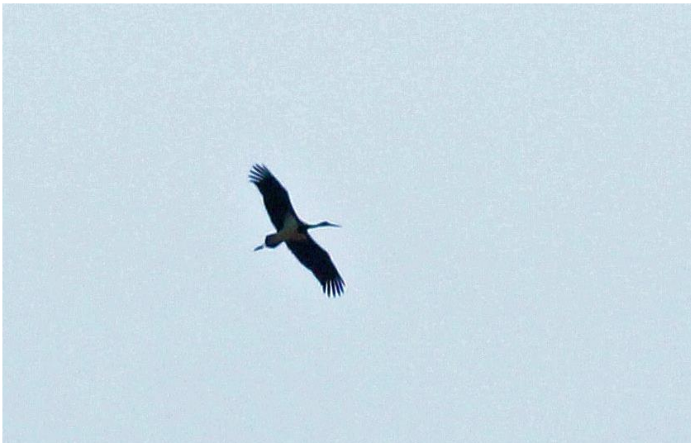
Black Stork at Sellindge (Derek Smith)