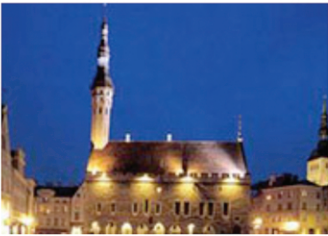
Tallinn Town Hall started in the 13th Century