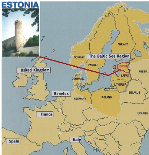
The Baltic Sea Region of Northern Europe