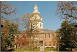
Maryland Capitol in Annapolis started in 1772