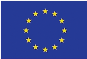
European Union (EU)

Estonia lies on the eastern shore of the Baltic Sea situated due east of Sweden and on the southern shore of the Gulf of Finland with the Estonian capital and largest city, Tallinn, about 20 miles from Helsinki, Finland.