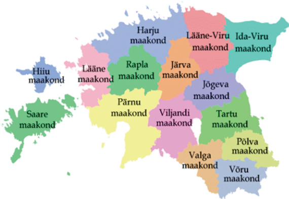
The 15 Counties of Estonia