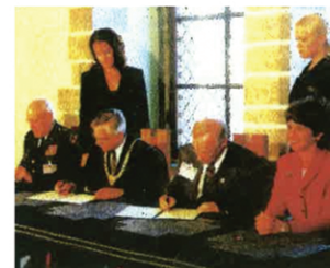
Signing in May 1999 in Tallinn, Estonia

In 2001 a non-profit nongovernmental organization (NGO) was formed to handle non-military issues between Estonia and Maryland with the MDNG and the Kaitseliit continuing to handle all military issues. Originally this NGO was named the Maryland/Estonia Education Consortium (MEEC). In 2005 MEEC changed its name to the Maryland-Estonia Exchange Council.