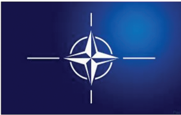
North Atlantic Treaty Organization (NATO)

MD’s capitol building having been in continuous legislative use since the 18th Century is the oldest State House in the USA. It was used as the US Capital from November 1783 until August 1784. The US Congress meeting in Annapolis ratified the Treaty of Paris in 1783 officially ending the Revolutionary War between the US and England.