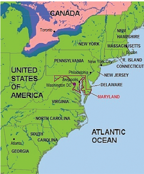
Maryland, one of the original 13 States of the USA