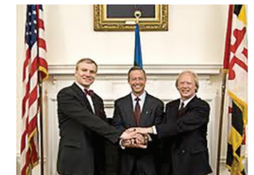
Signing in May 2009 in Annapolis, Maryland