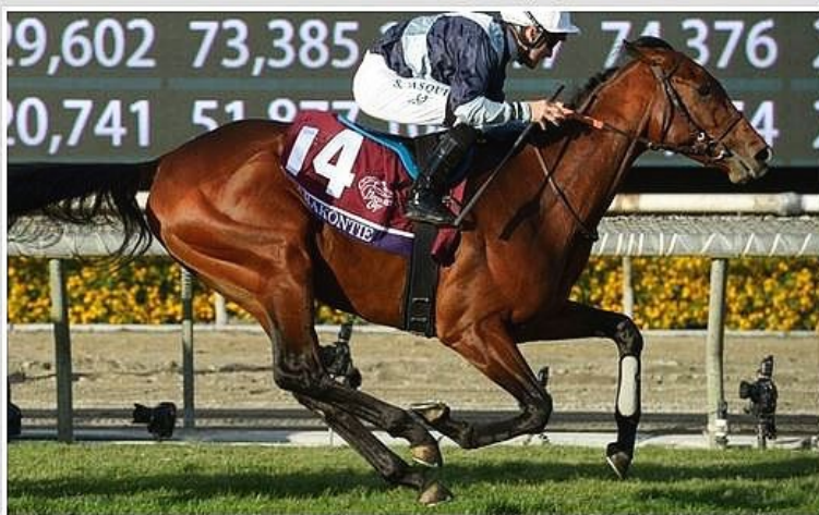
Breeders' Cup Mile: Globeform's Notebook horse Karakontie wins at 30-1

Full refund if level stakes bets on all runner from this book does now show a profit on July 1. Email alert service when horses are entered + best odds alerts included.