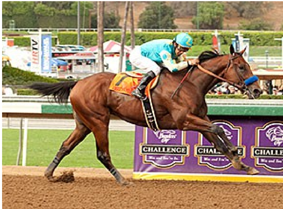
American Pharoah winning the FrontRunner at Santa Anita last year .