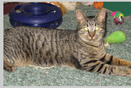
Amity, NKA Yuki, living very happily ever after in her furever home!

Our Mission: Felines First Rescue is a dedicated, no-kill network of volunteers and foster homes striving to help and care for the abandoned, stray, helpless and homeless felines in the Portland Metro area. All kittens are examined by a veterinarian, assessed for any special needs, vaccinated, tested, microchipped and spayed or neutered prior to leaving our care. We believe in every adoption being PURRFECT and FUREVER and are committed to providing post-adoption counseling, education and working as a resource for our community.