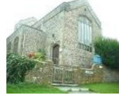
Our Lady of Lourdes