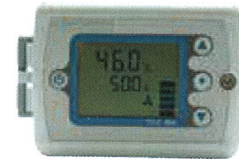
Digital Duct Humidistat