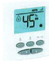
Digital Wall Humidistat