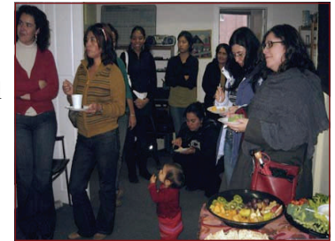
Attendants enjoying food and entertainment

MUJER has touched the lives of different women. Women from different generations, beliefs and backgrounds came together and shared why MUJER is an important organization for them and why it must continue. Thank you to everyone who attended the event. It was truly a success!