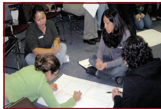
Trainees preparing presentations for younger girls

MUJER is extremely successful at reaching young people, empowering them, prompting them to action, and developing them into lead-