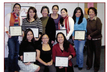
Leadership Training Graduates

MUJER also asked youth for the solutions. The answers were startling. For while they included such solutions as longer opening hours for community centres, better access to training, etc., the