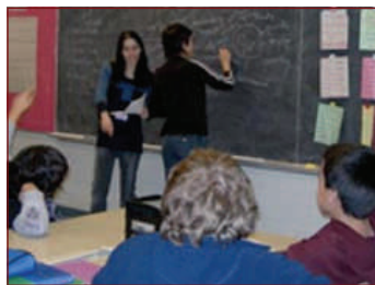
Trainees presenting at School

Our model was recognize for its ability to mobilize young people as agents of change to prevent violence and promote healthy relationships within the school, the family