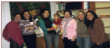
Members of the Board & attendants