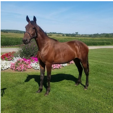
Al-Mar Fresno Bank