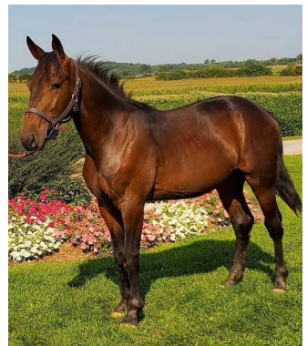
Quick Flash Photo