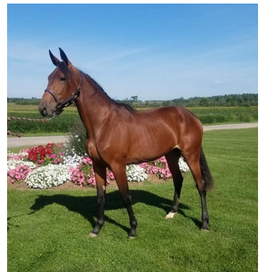
Al-Mar Risky Ridge