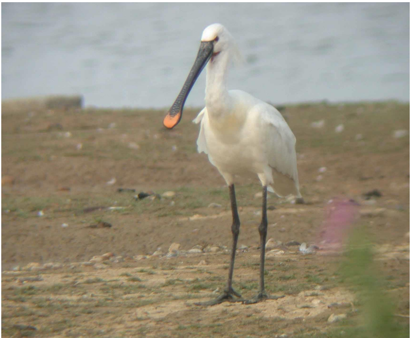
Spoonbill at Nickolls Quarry