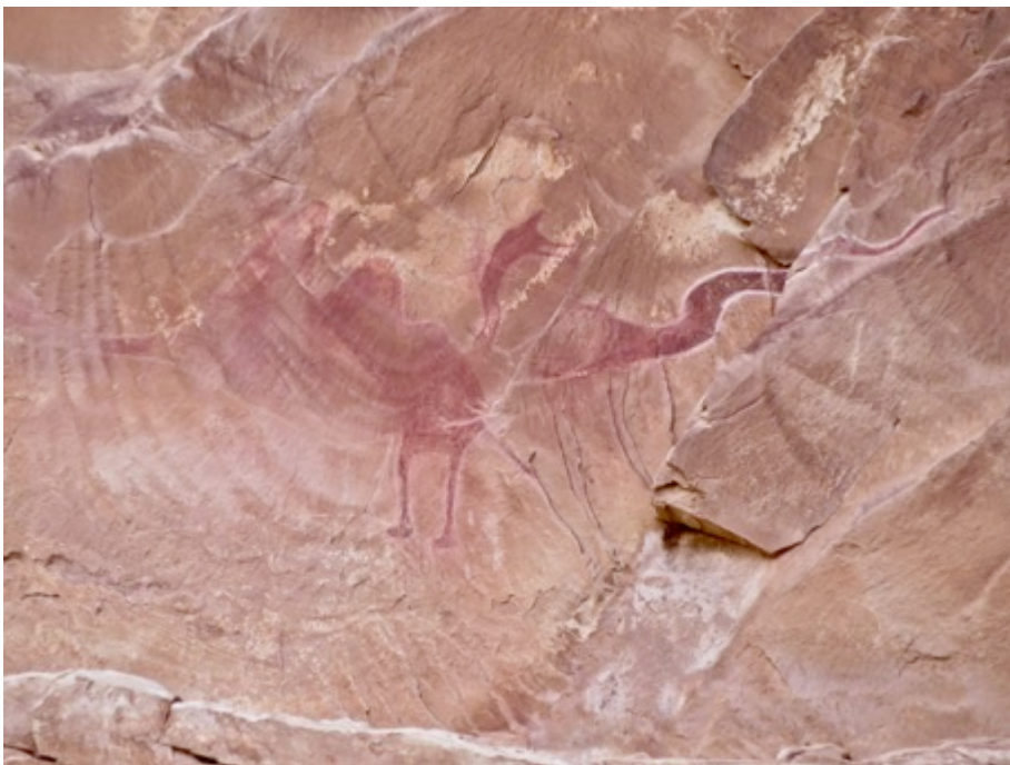
This bird figure has a wingspan of over 7 feet.