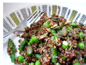
Recipe From My New Roots