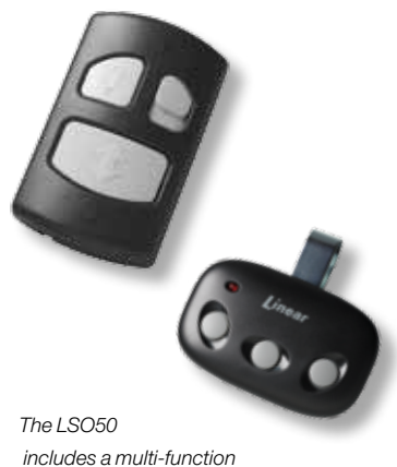
includes a multi-function Wall Station and 3-button Visor Remote Control