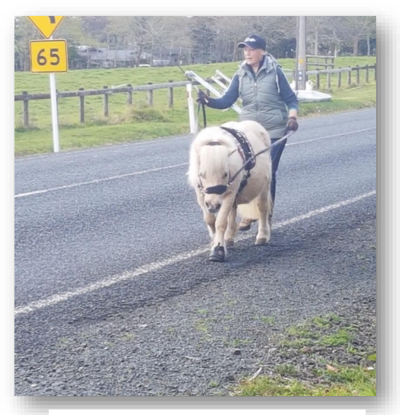
Narrandera Sateen has worked out 'stay to the left'

most from the exercise, as with 3 ponies to exercise individually, I certainly had to pull out my walking boots! However, now that we are back in level 3, the traffic has more or less returned with a vengeance. I think most people are so over lockdown.