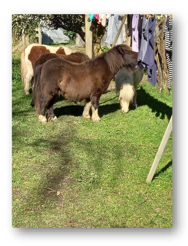
Toughear Park Vauxhall Reign, Lael Christmas Star with Lael Dandelion and Lael Sundae in the background.