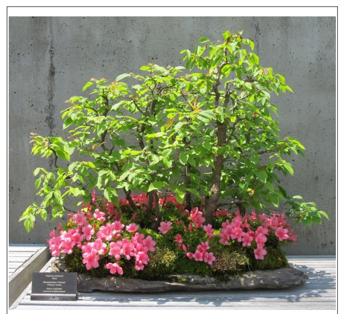
Hop-hornbeam and Chinzan Azalea composition at the NC Arboretum.

The BSC Executive Board will NOT meet after the July meeting. Members are always welcome to attend Board Meetings.