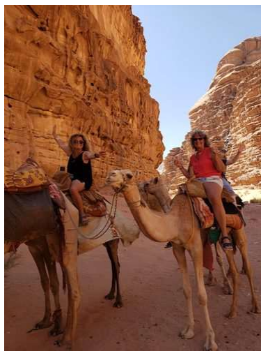
Riding camels in the red sand mountains of Wadi Rum