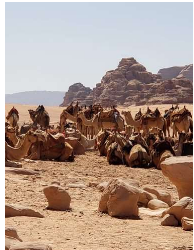
Camels in their natural habitat