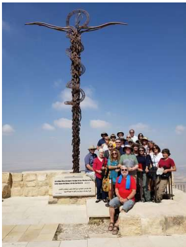
Mt. Nebo where Moses first saw the Promised Land