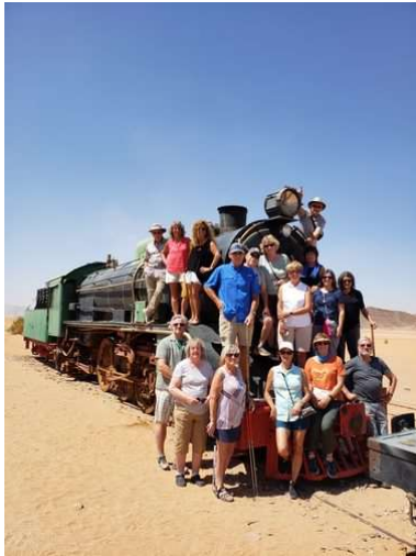
Reenacting Lawrence of Arabia on THE train

If you're new to our email list, click here to read about Israel & Egypt.