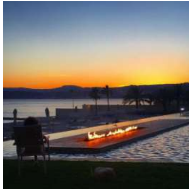
Aqaba Kempinski on the Red Sea