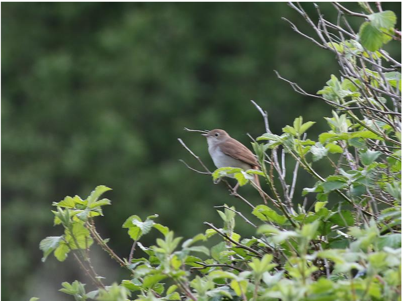
Nightingale at Oak Banks

Autumn migrants are very scarce and have comprised singles at Capel Battery on the 11 th August 1992, 18 th August 1992, 12 th August 1998, 11 th August 1999, 11 th August 2000 and 20 th August 2000, and at Creteway Down on a single date in August 2019.