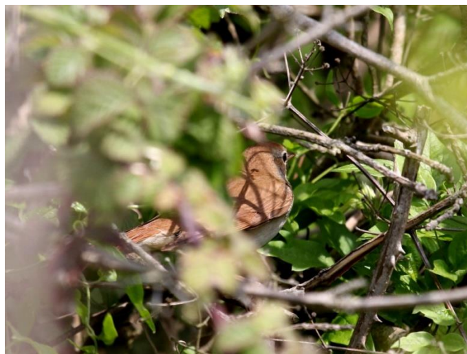
Nightingale at Folkestone Warren (Dale Gibson)

In Kent it is a locally common breeding species, with the county holding over a quarter of the national breeding population (KOS, 2020).