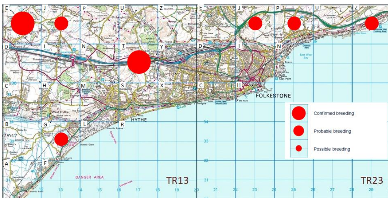
Figure 1: Breeding distribution of Nightingale at Folkestone and Hythe by tetrad (2007-13 BTO/KOS Atlas)

Figure 1 shows the breeding distribution by tetrad based on the results of the 2007-13 BTO/KOS atlas fieldwork.