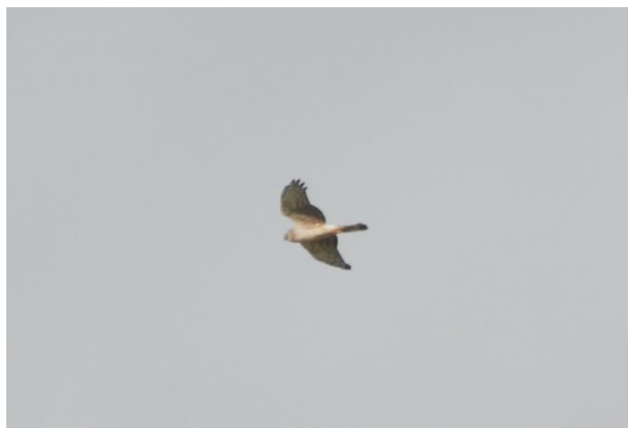
Hen Harrier at Beachborough