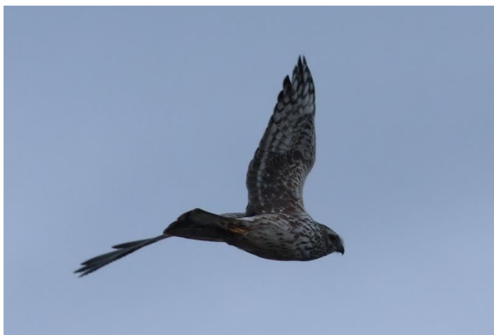
Hen Harrier at Botolph's Bridge