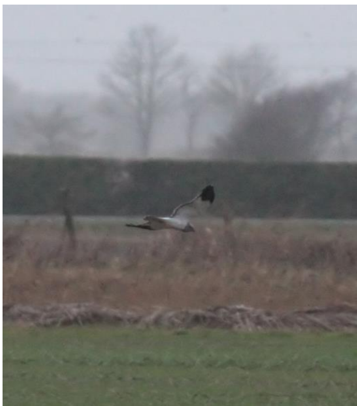
Hen Harrier at Botolph's Bridge