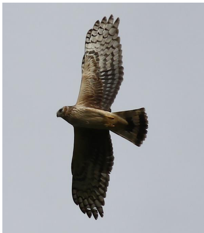
Hen Harrier at Botolph's Bridge