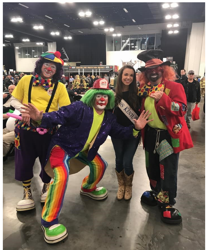
Miss Kentucky poses with members of Rizpah Cut-Ups