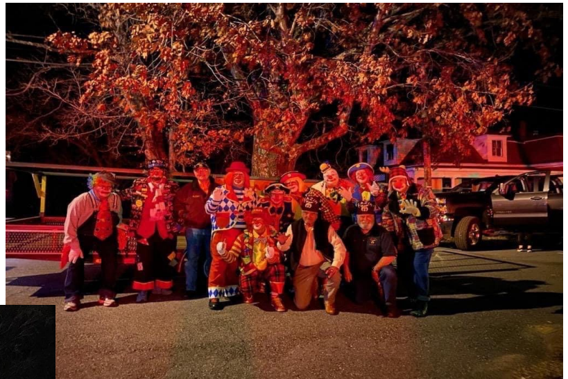
Kazim Central VA Clowns

Christmas is one of the most active times of the year for any parade Unit. This year the clown units from Kazim were out in force and covered a large area of the south west and central Virginia for Kazim.