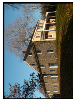
Haldeman Mansion Preservation Society