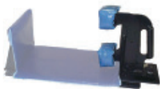
BD2670 McGuire/IMP Post Caps 3"L x 3"W x .5" Thick Pair