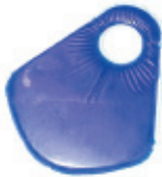
BD2610 Fracture Table Hip Pad Accepts up to 2.5" Post 10"L x 8"W x .5"H