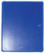
BD0100-100705 Gel Pad 10"L x 7"W x .5"H