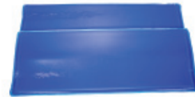
BD2650 / BD2655 Kambin/Wilson Frame Pads w/Velcro® BD2650: 29"L x 10"W x .5"H BD2655: 29"L x 10"W x 1"H Pair