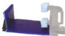
BD2700 Hip/Sacral Pad Set 1-BD2800 & 1-BD2810 Set