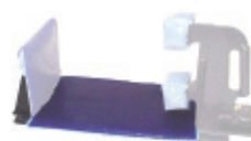
BD2800 McGuire™ / IMP® Base Pad 11"L x 17"W x 1/2"H Each