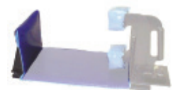
BD2810 McGuire™ / IMP® Back Pad 9"L x 11"W x 1/2"H Each