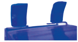
BD2250 Shoulder Brace Pads w/Velcro® 7"L x 5"W x .5"H Gel Area w/ 5" Wraps Pair