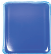
BD2640 Wheelchair Seat Cushion 16"L x 18"W x 5/8"H