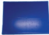
BD0100-172405 Gel Pad 17"L x 24"W x .5"H