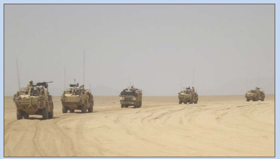
A Desert Patrol

Meanwhile back in Cyprus, C Company has borne the brunt of Cyprus duties and continued to maintain their readiness to deploy should the need arise, whilst D Company have held the Battalion together and enabled the deployment of B Company to take place in good order. The CO and B Company Group are now safely back and the Battalion has handed over the TRB mantle to 2 LANCS.