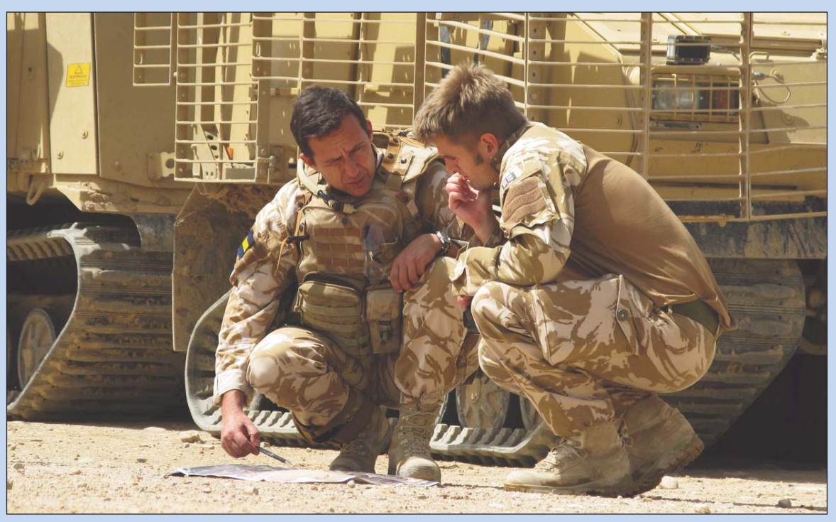
Briefing by the Commanding Officer