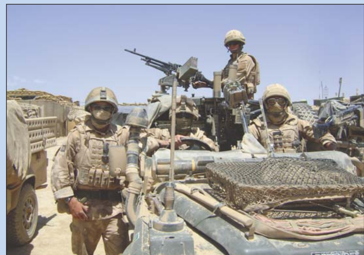
Ready for a dusty patrol

Meanwhile back in Cyprus, C Company has borne the brunt of Cyprus duties and continued to maintain their readiness to deploy should the need arise, whilst D Company have held the Battalion together and enabled the deployment of B Company to take place in good order. The CO and B Company Group are now safely back and the Battalion has handed over the TRB mantle to 2 LANCS.