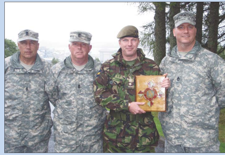
The Commanding Officer of 3 PWRR receiving presentation from US Maryland National Guard who sent observers to the Summer Camp

The weather and climate was exactly what we expected from Scotland, cold wet and grey even though it was the middle of August. Qualifications were given out on certain events of the Adv trg and most of the troops made it to the peak of Ben Nevis. The patrols exercise was run with an Afghanistan back ground and tested all levels of command in as many scenarios as possible. Live firing used a culmination of GPMG, UGL and grenades with the weapons