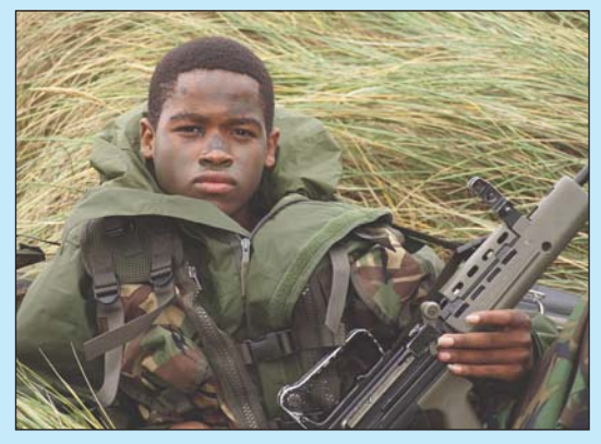
On Exercise On Penhale Training Area

It has been a busy year for PWRR army cadets from the City of London & North East Sector ACF, which includes a PWRR detachment in Bethnal Green. Since the beginning of the cadet year on Annual camp in July/August 2008, they have found themselves taking part in a range of military, adventurous training and ceremonial activities.