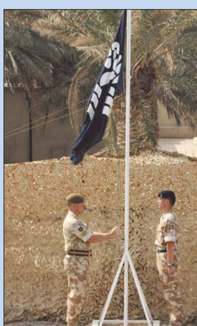
The 20 Armoured Brigade Flag is lowered for the last time in Iraq

The last 6 months have seen the 1st Battalion come back together after having been spread to the four winds during deployments in Afghanistan and Iraq.