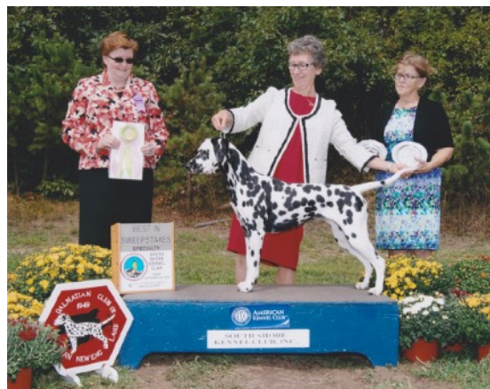
“FELICITY” Bellwether PatchMT Worth the Wait ACT I (CH Fiacre’s Calling Card CD, RN x GCH CH Blackthorn & PatchMT Thru the Looking Glass MX, MXJ) Best in Sweeps, DCSNE Specialty on 9-14-18, Falmouth, MA