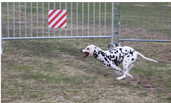
New titles for AJ(Garceau)