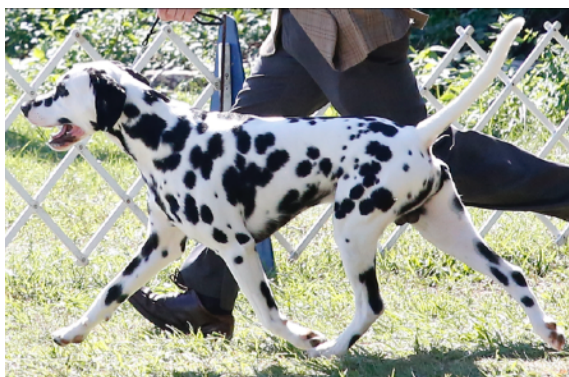
Oliver with handler Pepe Leyton