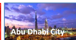
Abu Dhabi City