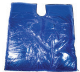
BD-BB4036-G Gel Bean Bag w/Shoulder Cutout Integral Gel Layer White Valve Replaceable 36"L x 40"W