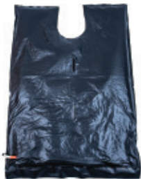
BD-BB3040 Traditional Bean Bag w/Shoulder Cutout White Valve Replaceable 40"L x 30"W