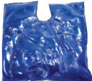
BD-BB4646-G Gel Bariatric Bean Bag w/Shoulder Cutout Integral Gel Layer White Valve Replaceable 46"L x 46"W