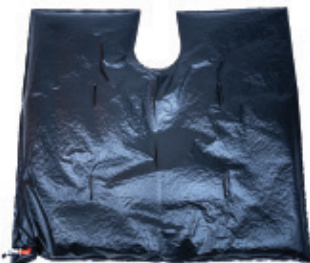
BD-BB4646 Traditional Bariatric Bean Bag w/Shoulder Cutout White Valve Replaceable 46"L x 46"W