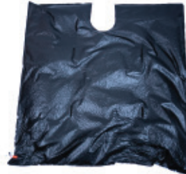
BD-BB4036 Traditional Bean Bag w/Shoulder Cutout White Valve Replaceable 36"L x 40"W