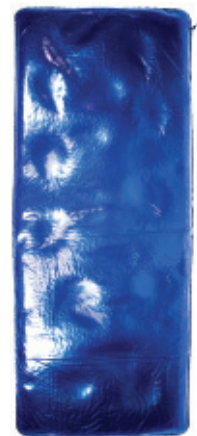
BD-BB3076-G Gel Full Length Bean Bag Integral Gel Layer White Valve Replaceable 76"L x 30"W