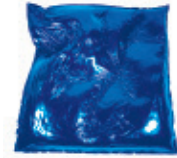
BD-BB2020-G Gel Bean Bag Integral Gel Layer White Valve Replaceable 20"L x 20"W