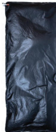
BD-BB3076 Traditional Full Length Bean Bag White Valve Replaceable 76"L x 30"W