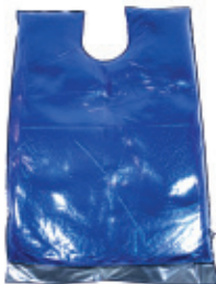
BD-BB3040-G Gel Bean Bag w/Shoulder Cutout Integral Gel Layer White Valve Replaceable 40"L x 30"W