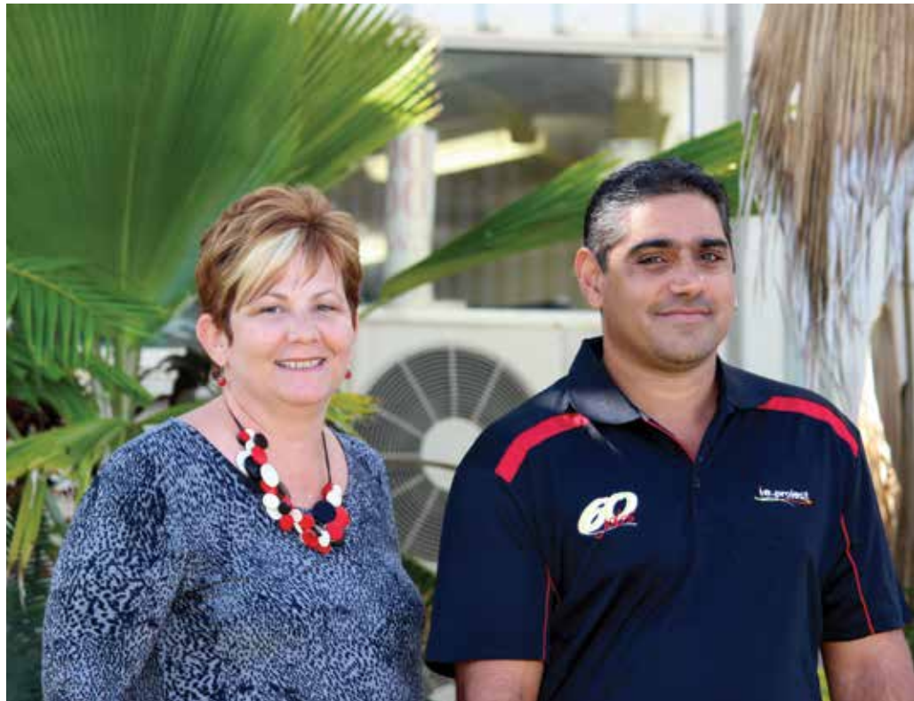
Trust Project Officers.

Supporting the sustainable growth of existing art and culture organisations in a way that promotes generational understanding of Indigenous culture and traditions and the establishment of sustainable culture-based businesses with tourism objectives.