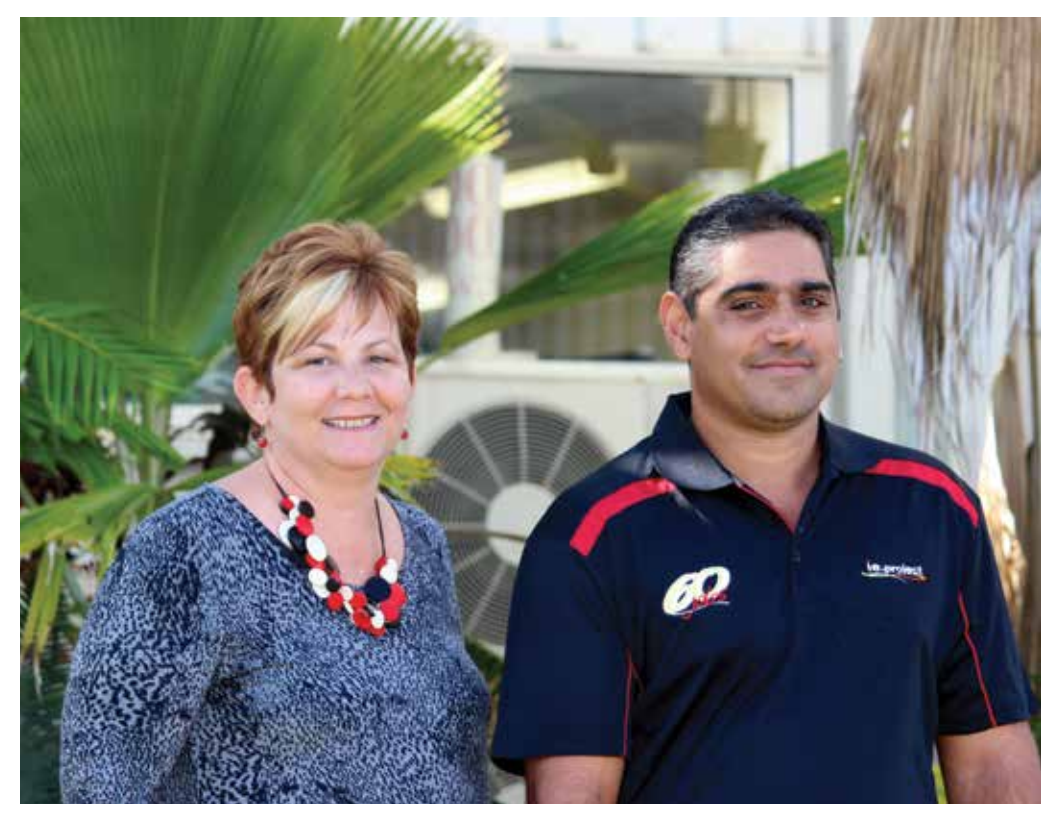
Trust Project Officers.

Supporting the sustainable growth of existing art and culture organisations in a way that promotes generational understanding of Indigenous culture and traditions and the establishment of sustainable culture-based businesses with tourism objectives.