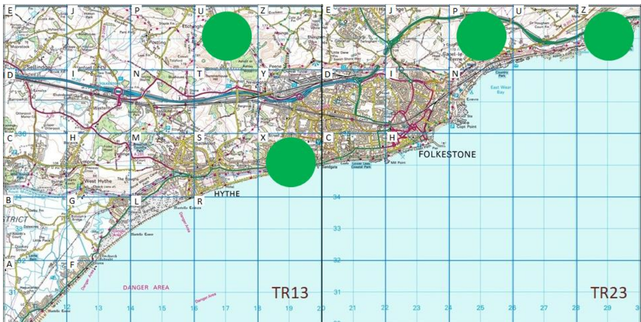
Figure 3: Distribution of all Greenish Warbler records at Folkestone and Hythe by tetrad

Figure 3 shows the distribution of records by tetrad.