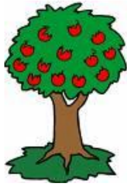
apple falls down, not up