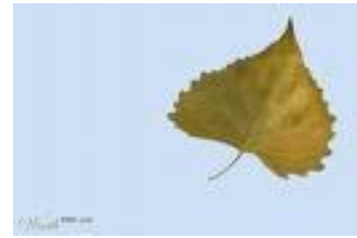
leaf falling to the ground