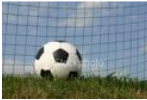
soccer ball rolls past the goal

A leaf drifts to the ground, A soccer ball rolls past the goal. How do these motions occur? They are due to powers called forces . All forces either pull or push. Sometimes it is easy to tell where the force is coming from: you push the scooter, and it moves. Other forces, like gravity are invisible. You can't see gravity , but it is pulling you down to Earth all of the time. A popular story is that Isaac Newton watched an apple fall one day and figured there must be a force pulling the apple down, rather than up, horizontally, or diagonally. The name of this force is gravity . Gravity is the attraction between objects and it is constantly at work.