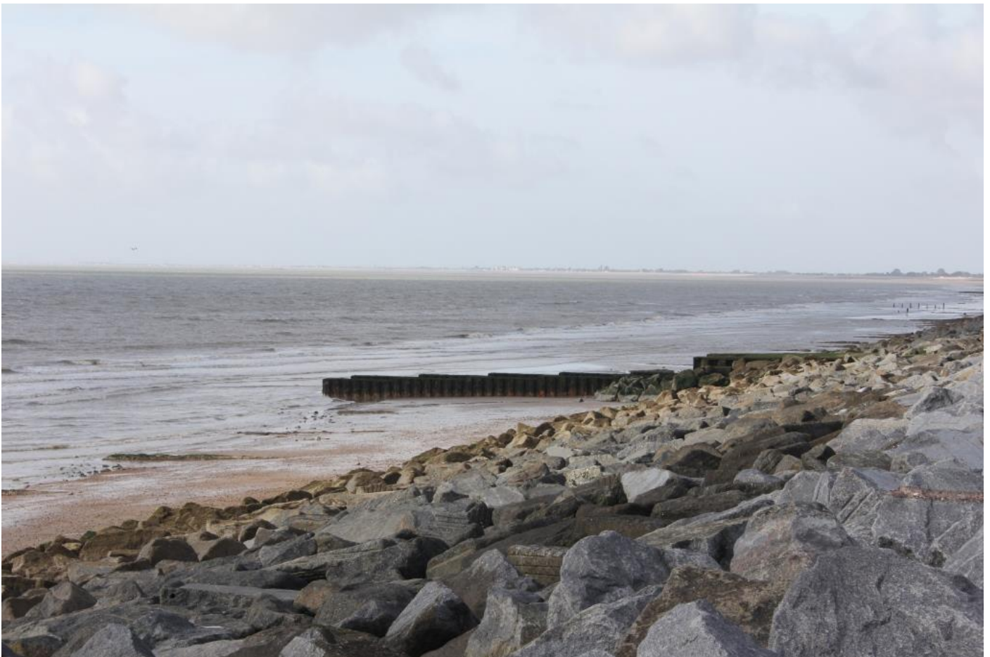
The shoreline and canal cutting outfall

Black Redstart, Wheatear and Rock Pipit have occurred on the seawall on passage, as has a Shore Lark in November 2015.