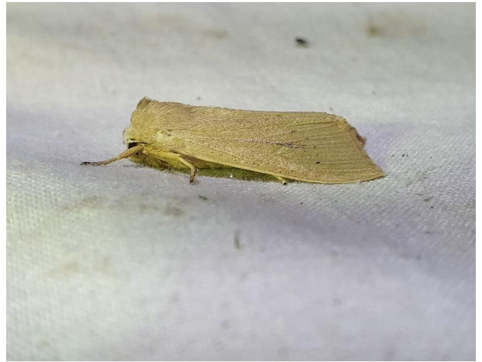
Large Wainscot on the seawall