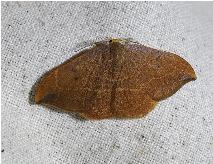
Oak Hook-tip on the seawall

A list of all species recorded in the tetrad is provided below in Appendix 2.