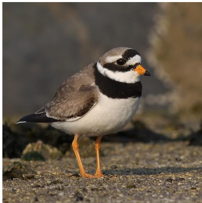
Ringed Plover on the beach