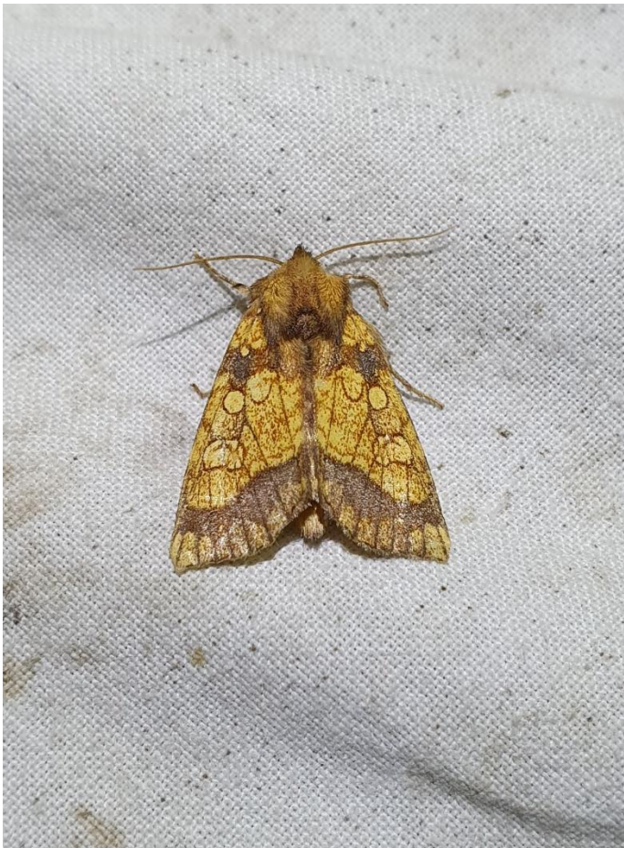
Frosted Orange on the seawall