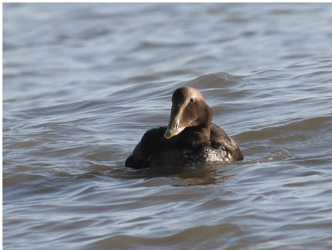
Eider off the seawall