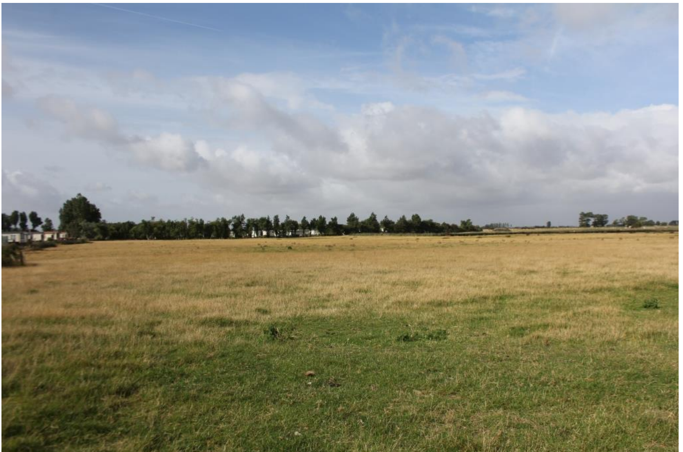
Romney Marsh inland of the New Beach Holiday Park

The Romney Marsh “proper” is typically a highly irregular landscape created through piecemeal enclosure and drainage, with mainly small, irregularly shaped fields, highly sinuous roads, and a dispersed settlement pattern. Some of the gently curving field boundaries appear to incorporate the lines of naturally meandering creeks. The Romney Marsh is the third largest coastal wetland in Britain.