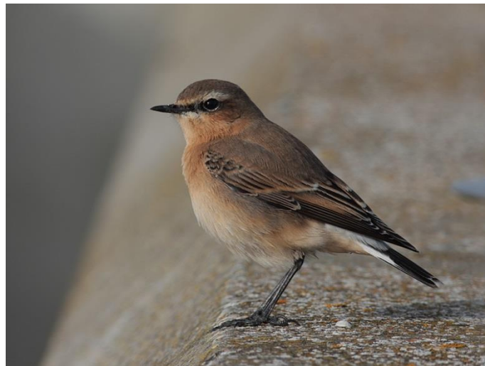
Wheatear on the seawall