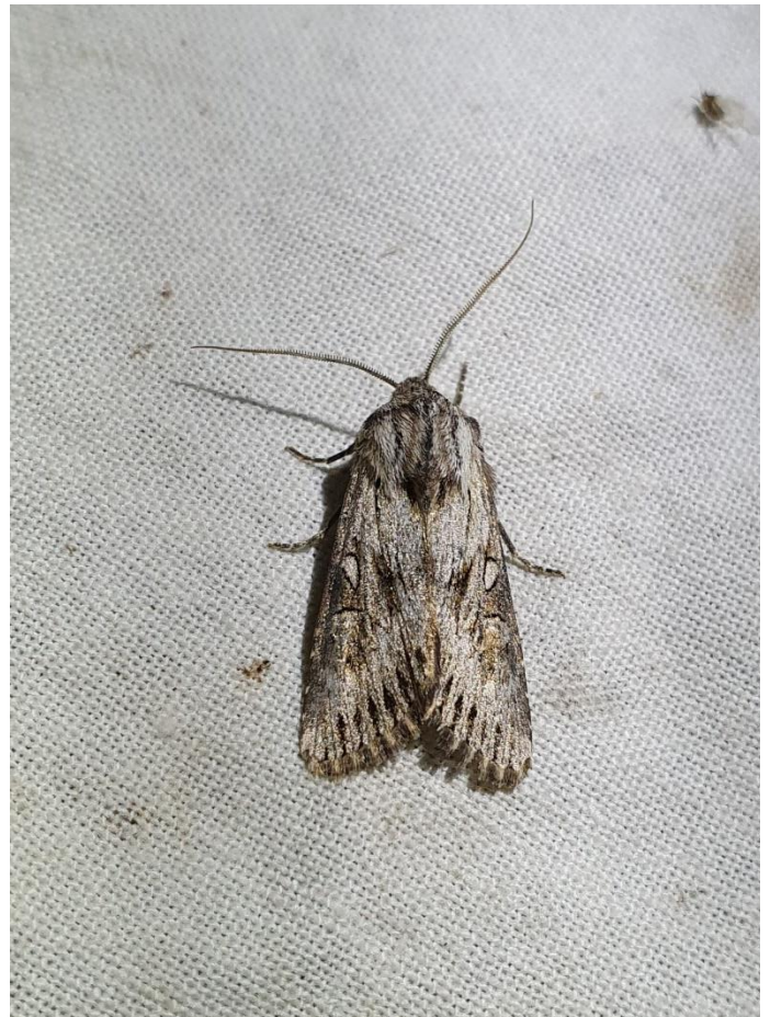
Feathered Brindle on the seawall