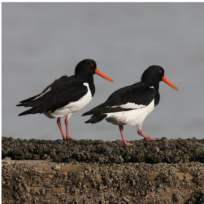
Oystercatchers on the outfall