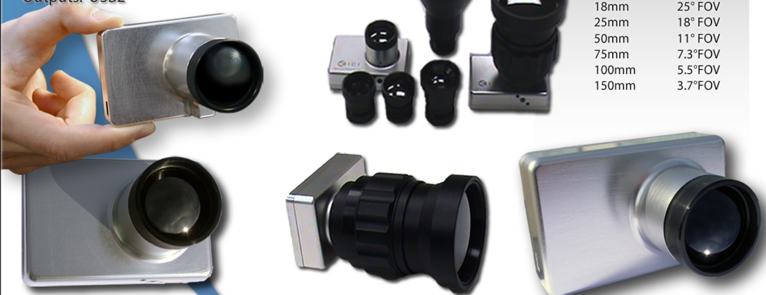
ICI 7320 shown with optional 35 Micron Microscopic Lens

Automatic or Manual Gain and Level 1 watt input powered by computer USB connection Weight: 5.2 oz (148g) w/ lens Dimensions: 2.1" x 3.2" x 0.5" (53mm x 81mm x 13mm) Data Interface: USB2 Outputs: USB2