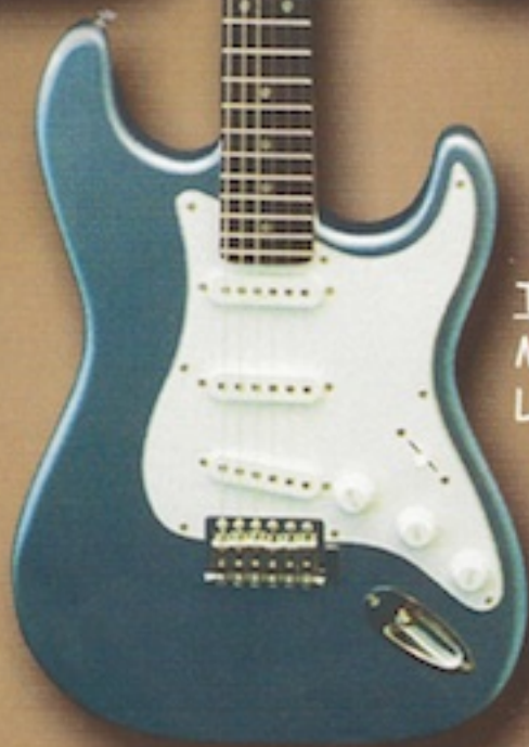
T10M Metallic Light Blue

Available in Opaque, Transparent, Sunburst and Metallic Finishes Also available in Left Hand Models (Not Shown)