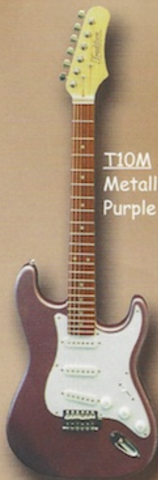
T10M Metallic Purple