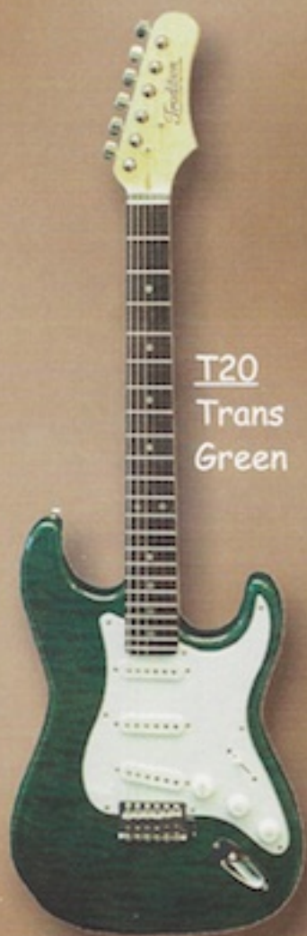
T20 Trans Green