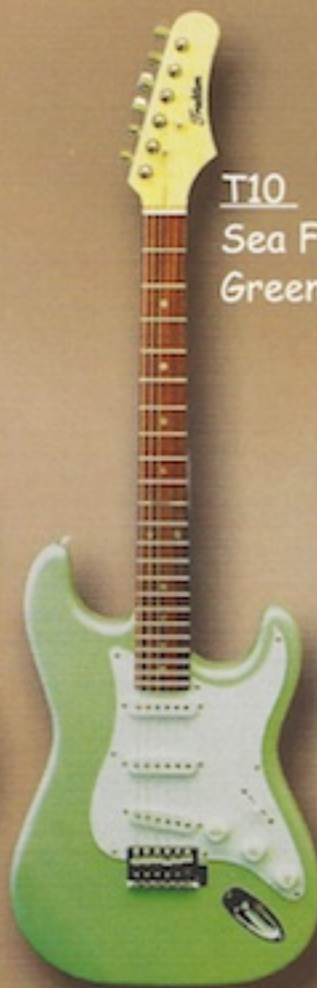
T10 Sea Foam Green