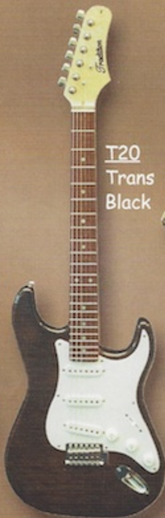
T20 Trans Black