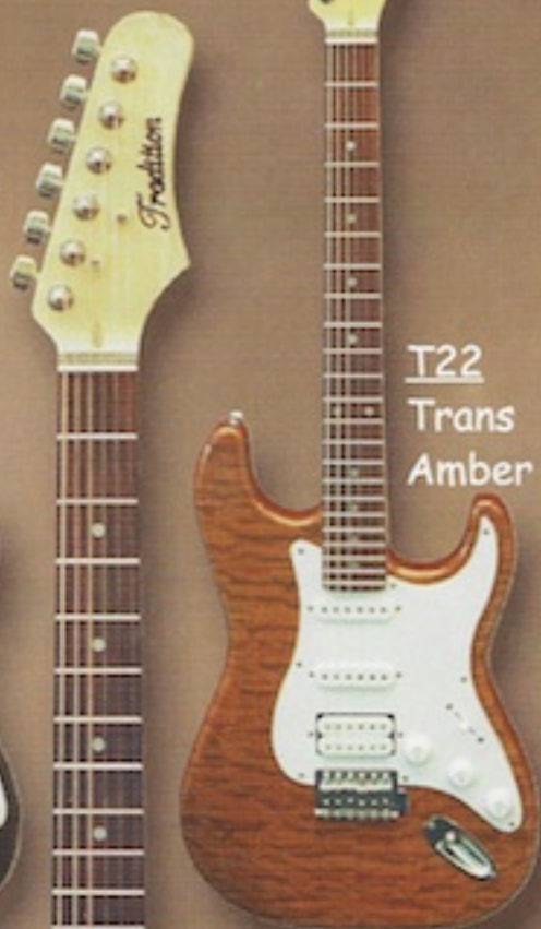
T22 Trans Amber