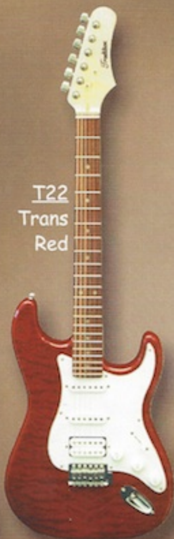
T22 Trans Red