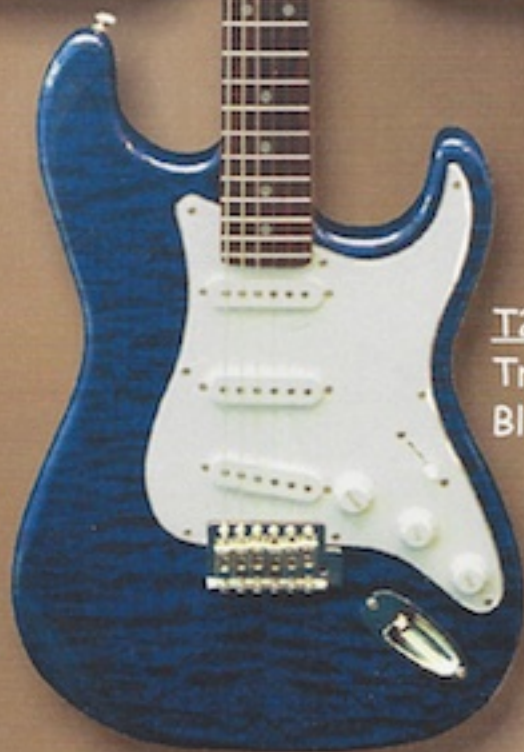
T20 Trans Blue

Available in Transparent and Sunburst Finishes Also available in Left Hand Models (Not Shown)