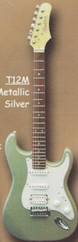
T12M Metallic Silver