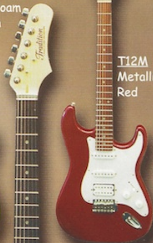
T12M Metallic Red