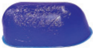
BD2440 Versatile Roll 13"L x 7"W x 5.5"H