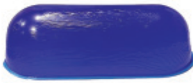
BD2450 Versatile Roll 16"L x 7"W x 5.5"H