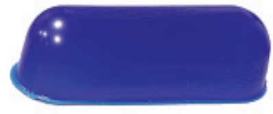
BD2460 Versatile Roll 20"L x 7"W x 5.5"H