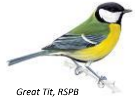
Great Tit

The small bush conifers in our back garden stand out against the muted and faded greens of buddleia, nettle and sage. Most leaves have fallen, or, like the apple tree, hang on defiantly in ones and twos at the very tip-tops of the branches, in single slashes of orange-yellow. But these conifer shrubs are vibrant in steely-blues and yellow-greens, with channels of shadow running through like dark glaciers.