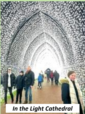
In the Light Cathedral

The analysis also gives me a world map of people who are distant relatives. I don't think I am going to follow them up!