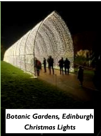
Botanic Gardens, Edinburgh Christmas Lights

The analysis also gives me a world map of people who are distant relatives. I don't think I am going to follow them up!