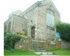
Our Lady of Lourdes