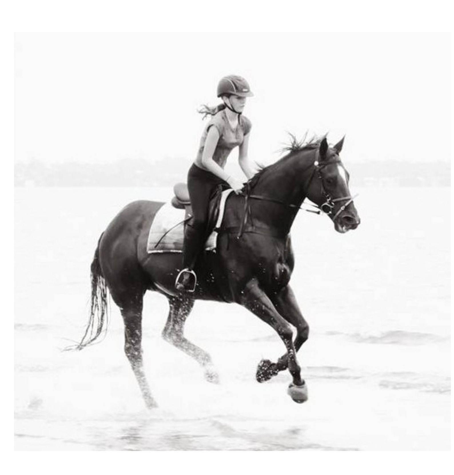
In riding a horse we borrow freedom