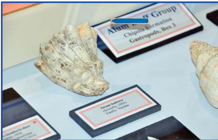
Fossil Shell of the Show - Vasum species