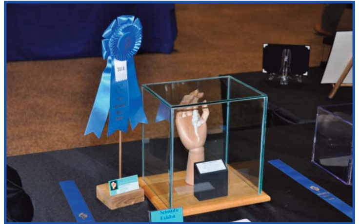
1st Place - Scientific