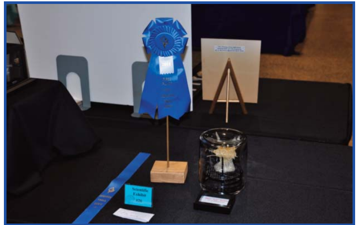
1st Place - Scientific