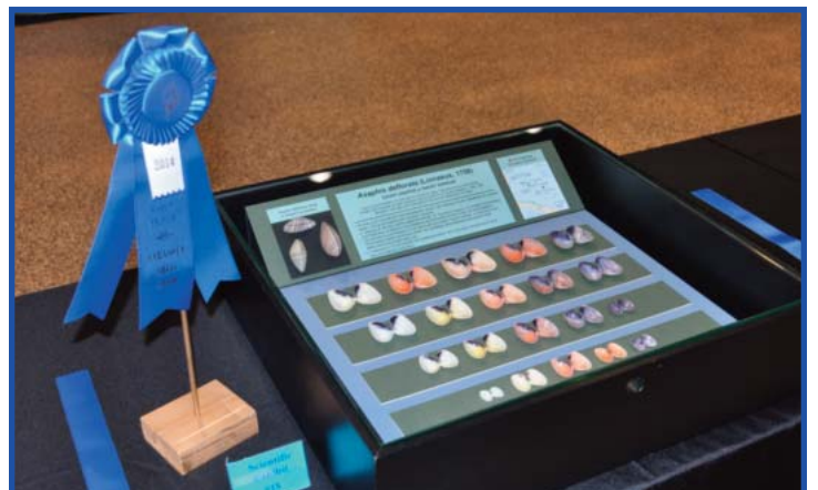
1st Place - Scientific