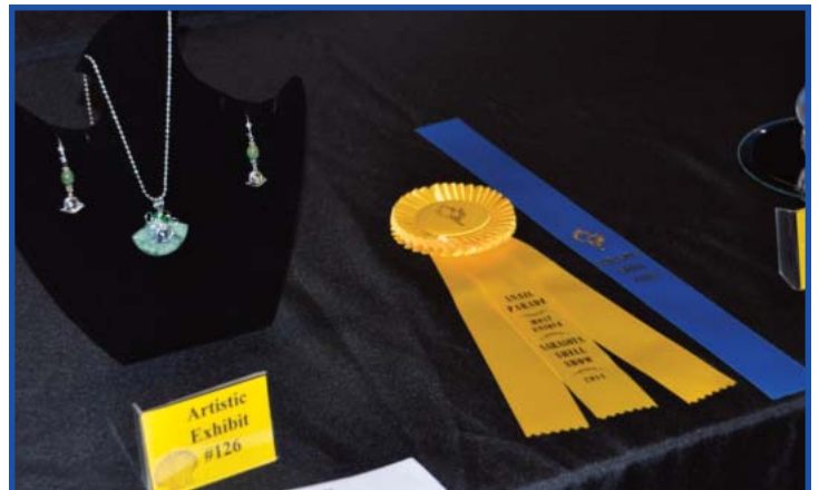
Snail Parade - Most Unique - Angela Sampogna