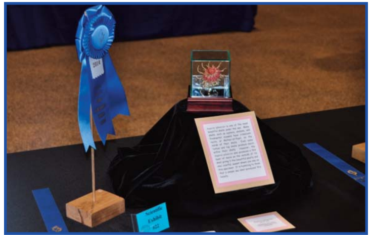
1st Place - Scientific