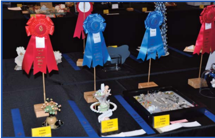
1st Place - Artistic