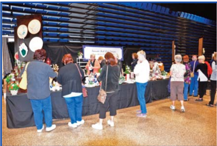
The artist's area.