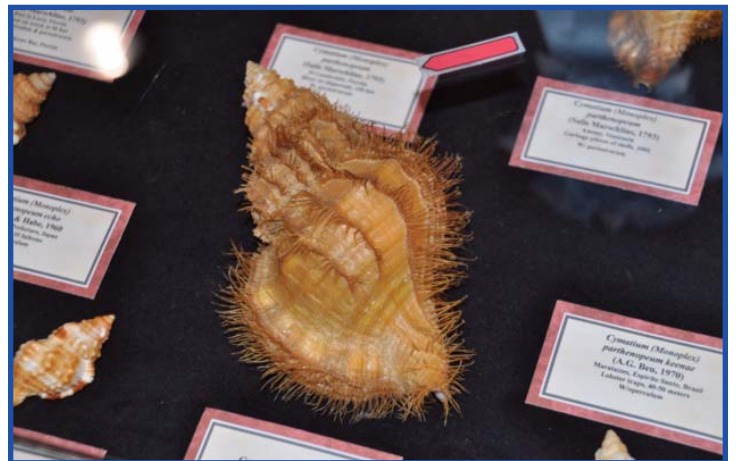
Shell of the Show - Cymatium species