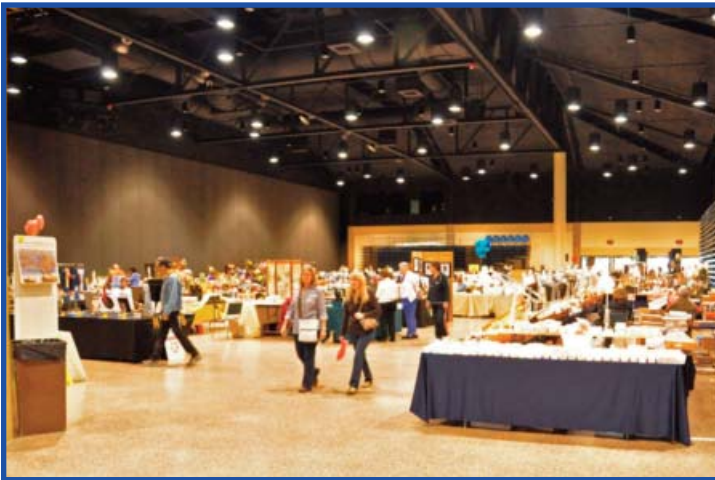
A general view of the show in progress.