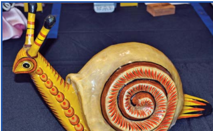
Big Brown Snail