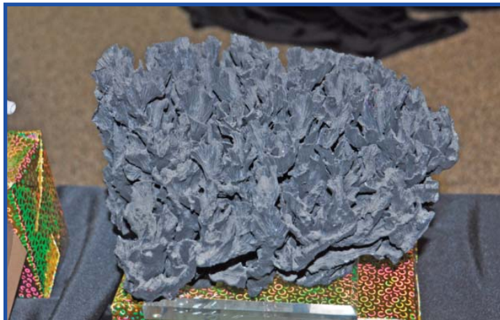
I wanted it also (also didn't get it)