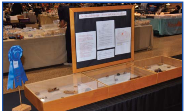
1st Place - Scientific