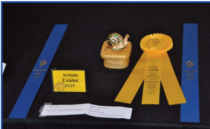
Snail Parade - Most Beautiful - Angela Sampogna