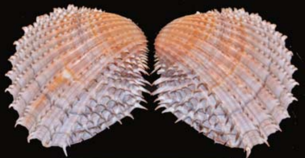
Acanthocardia aculeata (Linnaeus, 1758) EUROPIAN SPINY COCKLE