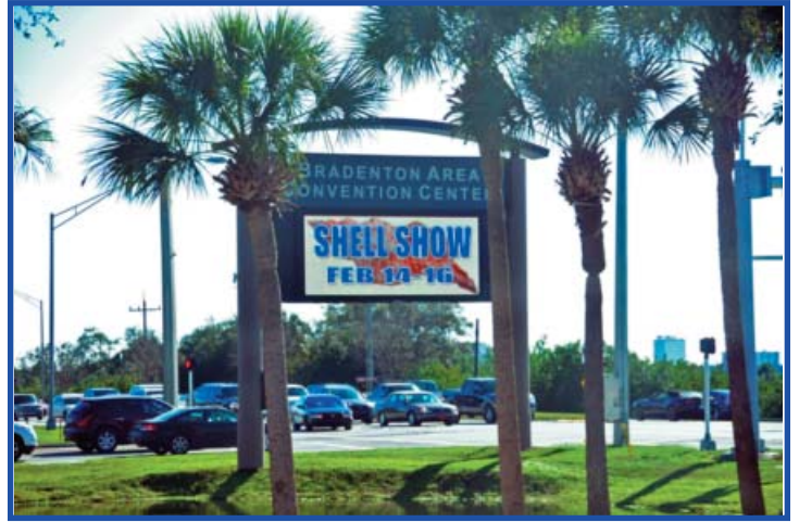
The beginnings of our shell show - the advertising of the show at the Bradenton Convention Center!