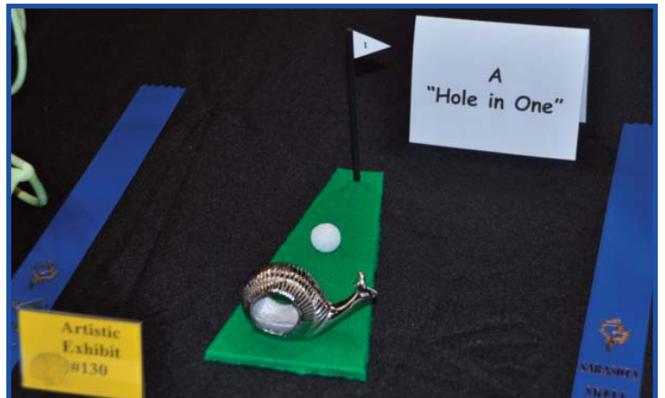
Hole in One