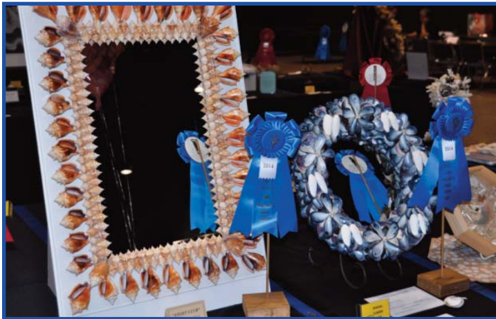
1st Place - Artistic