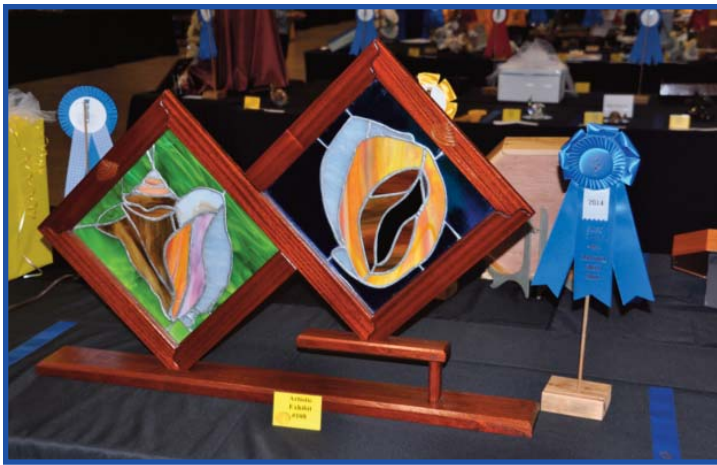
1st place - Artistic