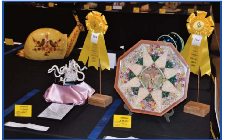
Commercial Art Awards