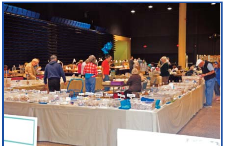
Members working the club table.