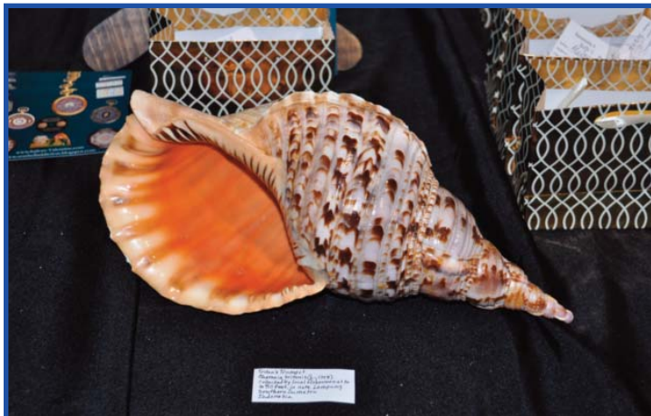
I wanted it (didn't get it)