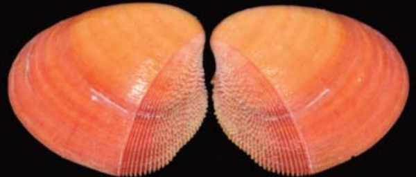
Nemocardium bechei (Reeve, 1847) BECHE'S COCKLE