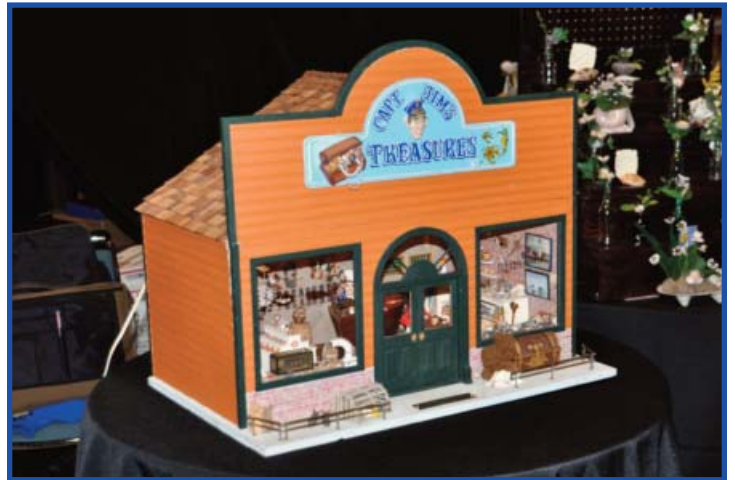
Our newly acquired miniature shell store.