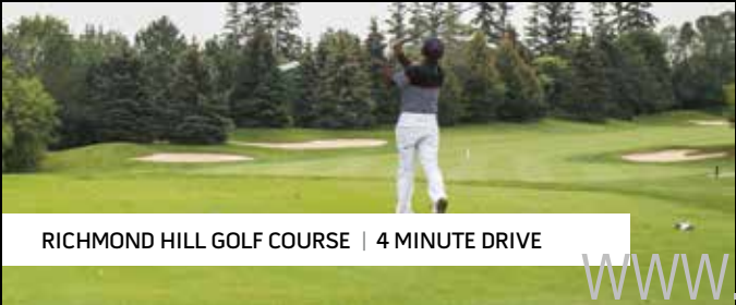
RICHMOND HILL GOLF COURSE | 4 MINUTE DRIVE

Richmond Hill offers over 600 hectares of natural parklands and open spaces, miles of walking trails, meadows, kettle lakes and panoramic lookouts. Fitness and healthcare facilities abound, from major hospitals to spas, gyms, 5 hockey arenas, 6 pools, including the GTA's largest wave pool and 10 communities centres.