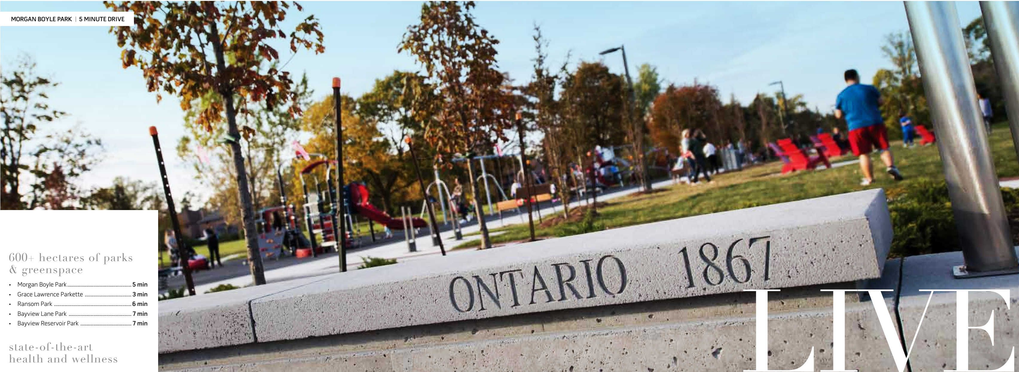
MORGAN BOYLE PARK | 5 MINUTE DRIVE