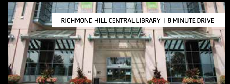
RICHMOND HILL CENTRAL LIBRARY | 8 MINUTE DRIVE