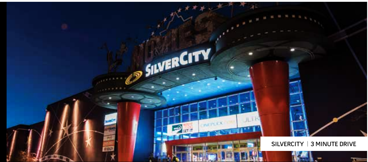
SILVERCITY | 3 MINUTE DRIVE

With an array of prestigious public and private schools, numerous libraries, a diverse performing arts scene, theatres and cinemas, fairs and festivals, all within easy walking or driving distance, your family can live a vibrant and culture-rich life.