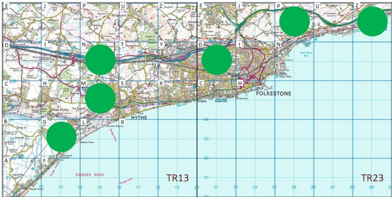
Figure 3: Distribution of all Corncrake records at Folkestone and Hythe by tetrad

Figure 3 shows the distribution of records by tetrad.